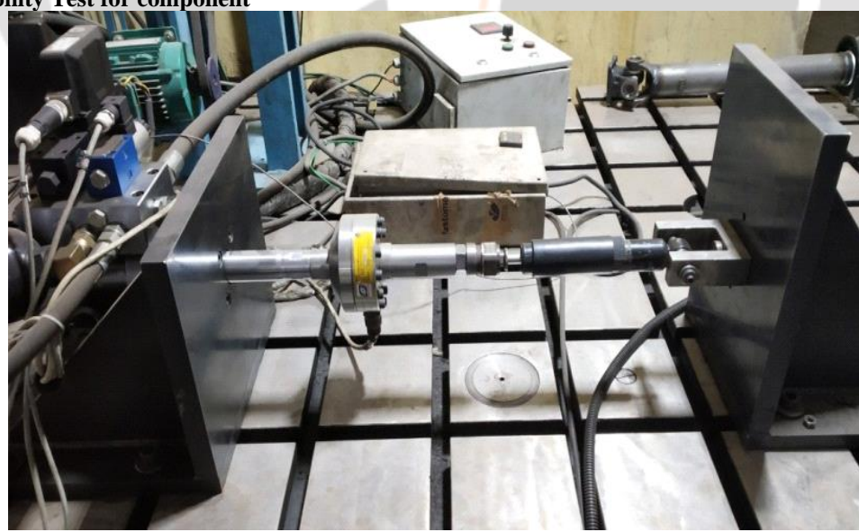
Fig. 5.6: Durability Tester for component

Durability test was performed on Durability Tester with following test conditions. Temperature was maintained 30±10°C. The number of cycles was 3,00,000 with frequency of 1-3 Hz. The stroke length was 11 mm. Required specification by customer was,