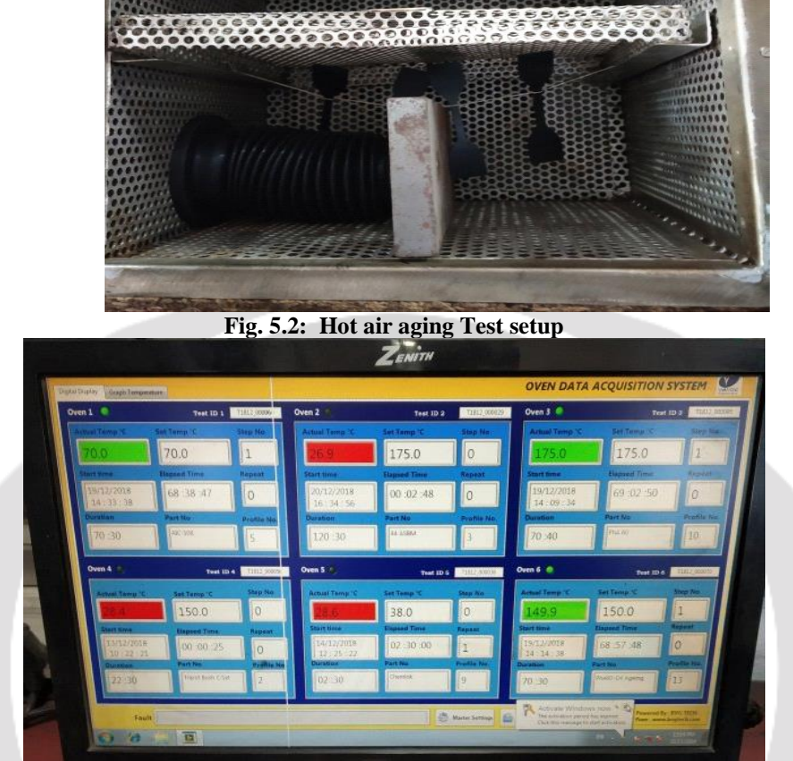
Fig. 5.3: Hot air aging Test screen

Hot air aging test was carried out in oven with 100 degree Celsius for 70hours.Both cut samples and actual work piece kept in same oven for processing. Parameters were recorded by software attached to the system.