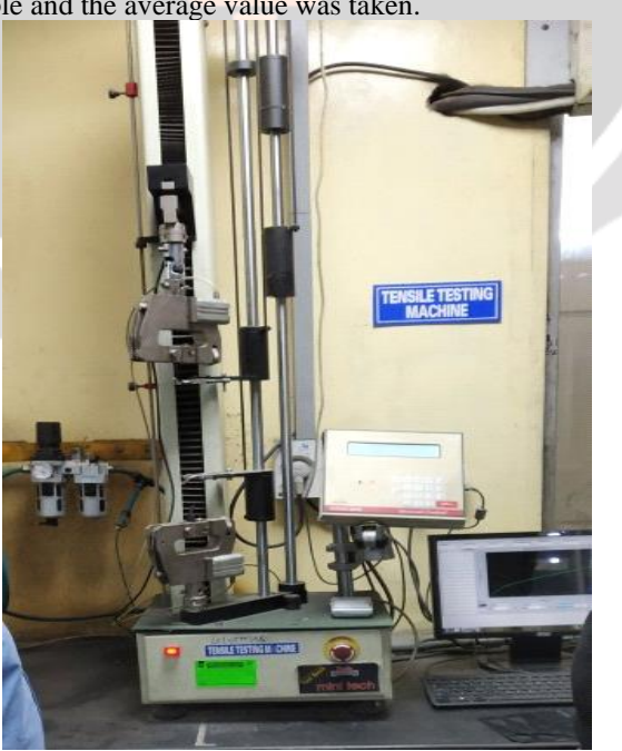
Fig. 5.1: Universal Testing Machine

Tensile strength was measured with a Microvision testing machine (UTM) at a test speed of 500 mm/min. Dumb-bell shaped test samples were punched out from the moulded sheets along the grain direction. The thickness of the specimen was recorded before testing. The tensile strength, elongation at break, stress at 100%, 200% and 300% of elongation are recorded by software 'Star Testing 2012' software. At least five specimens were tested for each sample and the average value was taken.