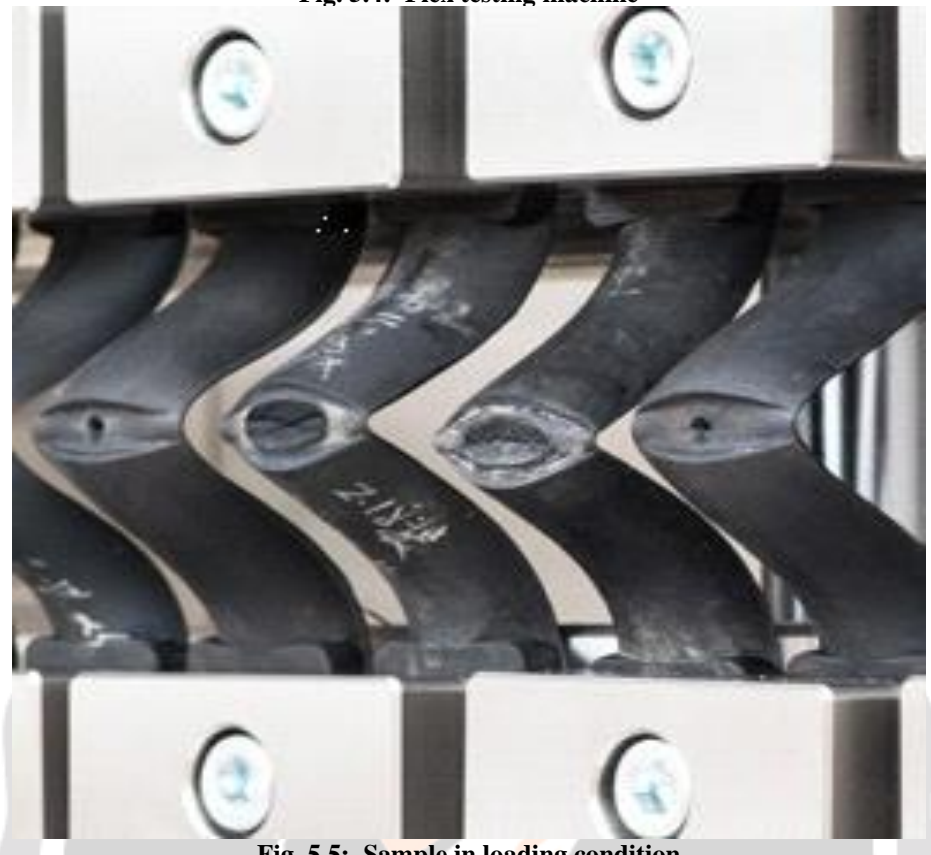
Fig. 5.4: Flex testing machine