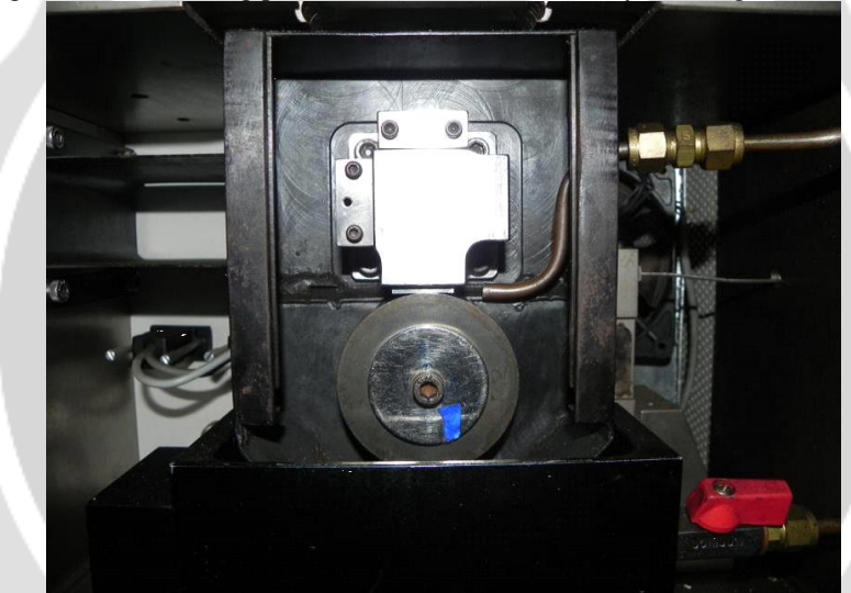
Fig. 5.7: Schematic arrangement and Photograph of experimental set up (Tribometer TR-25) a) Test Conditions for Wear test

The schematic arrangement of the testing procedure has been indicated by line diagram in Figure