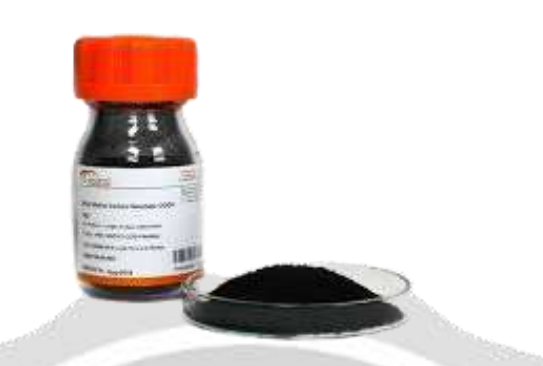
Fig-5: MWCNT Powder