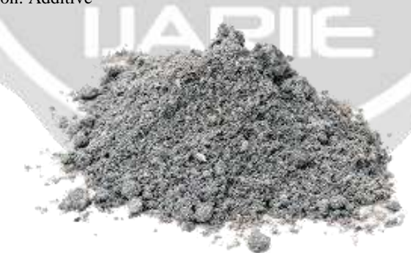
Fig-4: Fly Ash