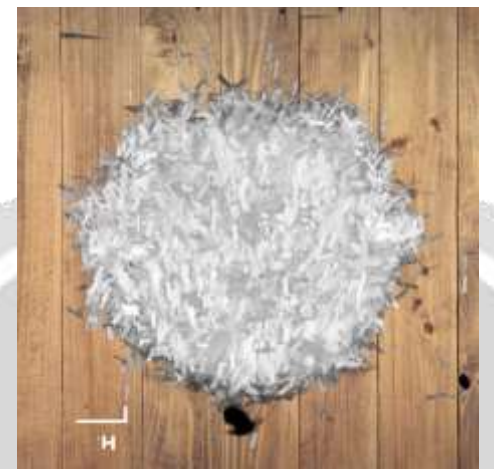
Fig-3: E Glass

Composition: 54% SiO<sub>2</sub> – 15% Al<sub>2</sub>O<sub>3</sub> – 12% CaO Role in Composition: Additive, Strengthener Major Properties: