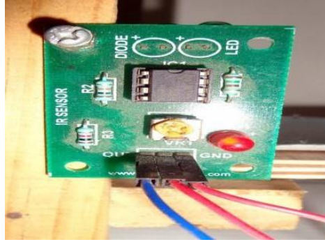
Fig 1: Photoelectric Sensor