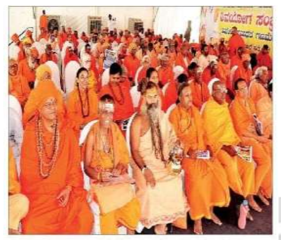
ಬೆಂಗಳೂರಿನಲ್ಲಿ ನಡೆದ ಅಸಂಖ್ಯ ಪ್ರಮಥರ ಗಣಮೇಳದಲ್ಲಿ ಭಾಗವಹಿಸಿದ್ದ ಸಾಧು ಸಂತರು.