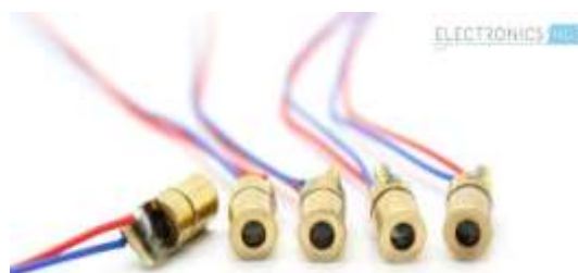
Fig. 3. LASER Diode

Lasing wavelength (8 D): (630 – 645) nm, P_o=5mW