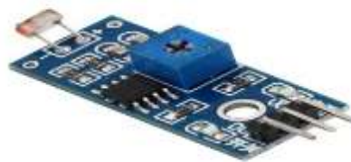
Fig. 4. LASER Diode Receiver