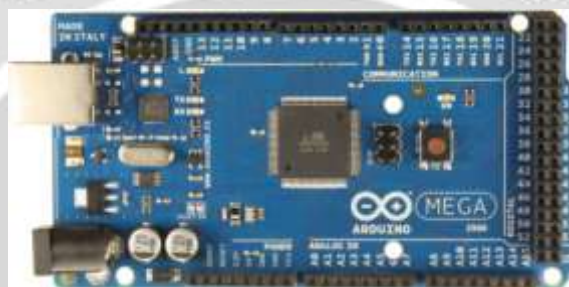
Fig.2. Arduino Mega 2560 microcontroller.