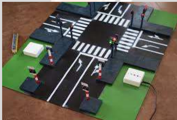
Fig. 1. Intersection of 4 monodirectional roads.

Roads in the form of '+' are designed as 4 monodirectional intersection as shown in fig .1 . We first need to observe and investigate the existing traffic signals and look for the necessary changes that could be made. Now some improvising should be done by installing our smart signal technique at intersection of road . Various routing configurations, our next step will be an extension of the suggested traffic light system to a bidirectional "+" junction ,Main moto of our research targets management of traffic light system at bidirectional roads.