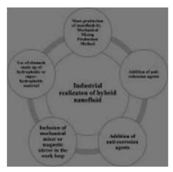
Fig.1 Types of Nanofluid