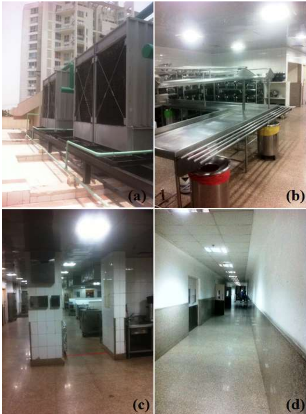
Figure 8: (a) AC plant (b) Cooking area (c) Catering unit (d) corridors