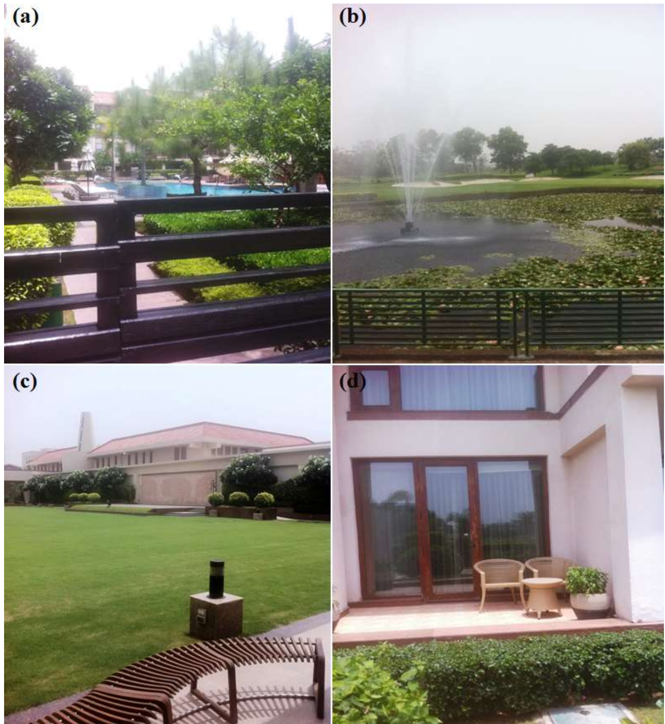
Figure 7: (a) Pool area (b) Golf area (c) Outdoor gathering space (d) Outdoor sitting area