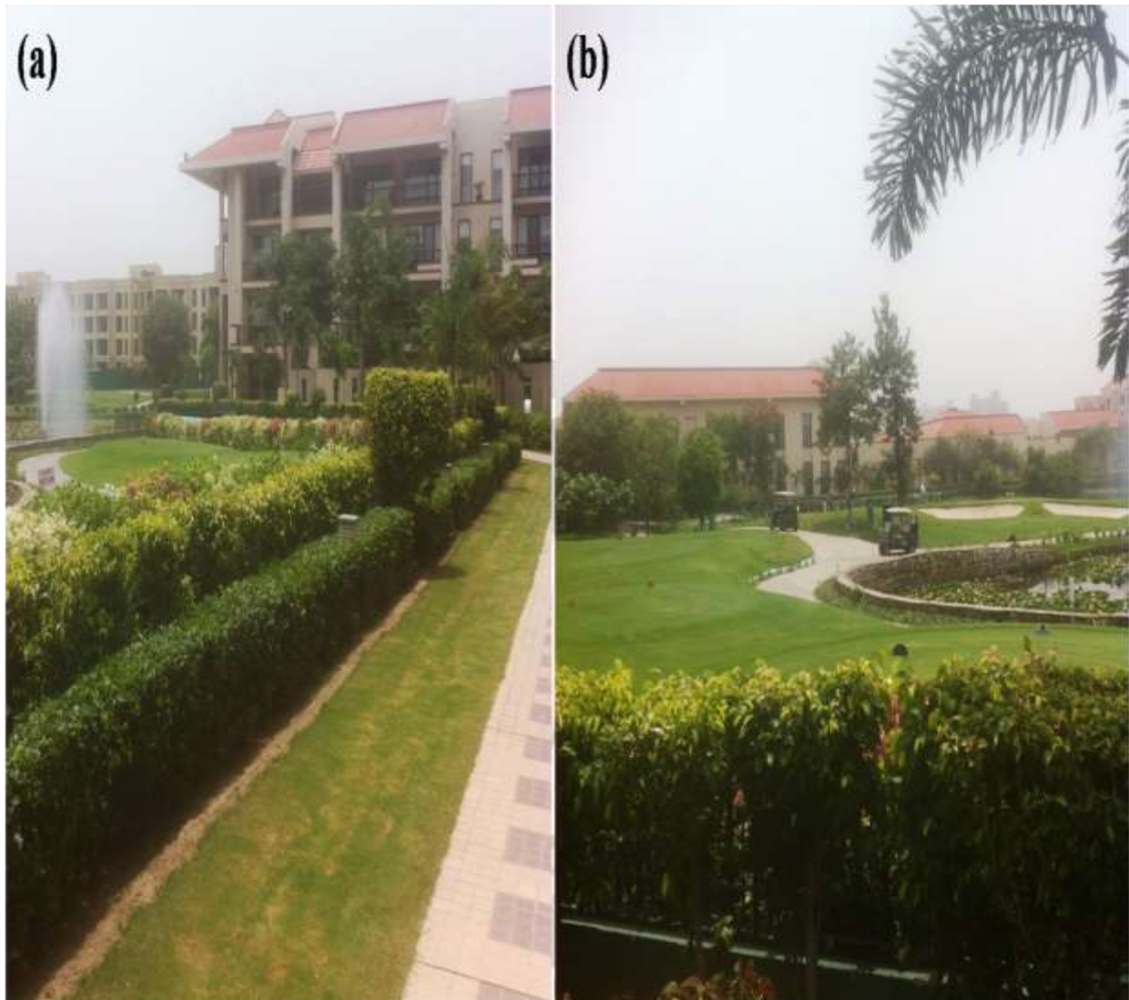
Figure 6: Resort view and outside dwellings