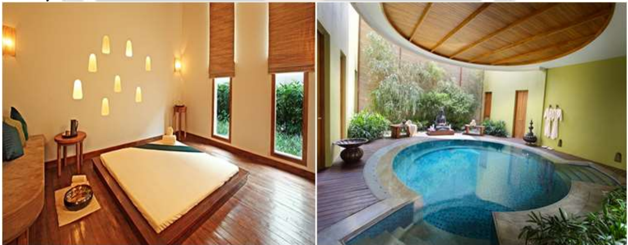
Figure 3: The spa services provided. Picture courtesy: Jaypee Hotels and Resorts [10].