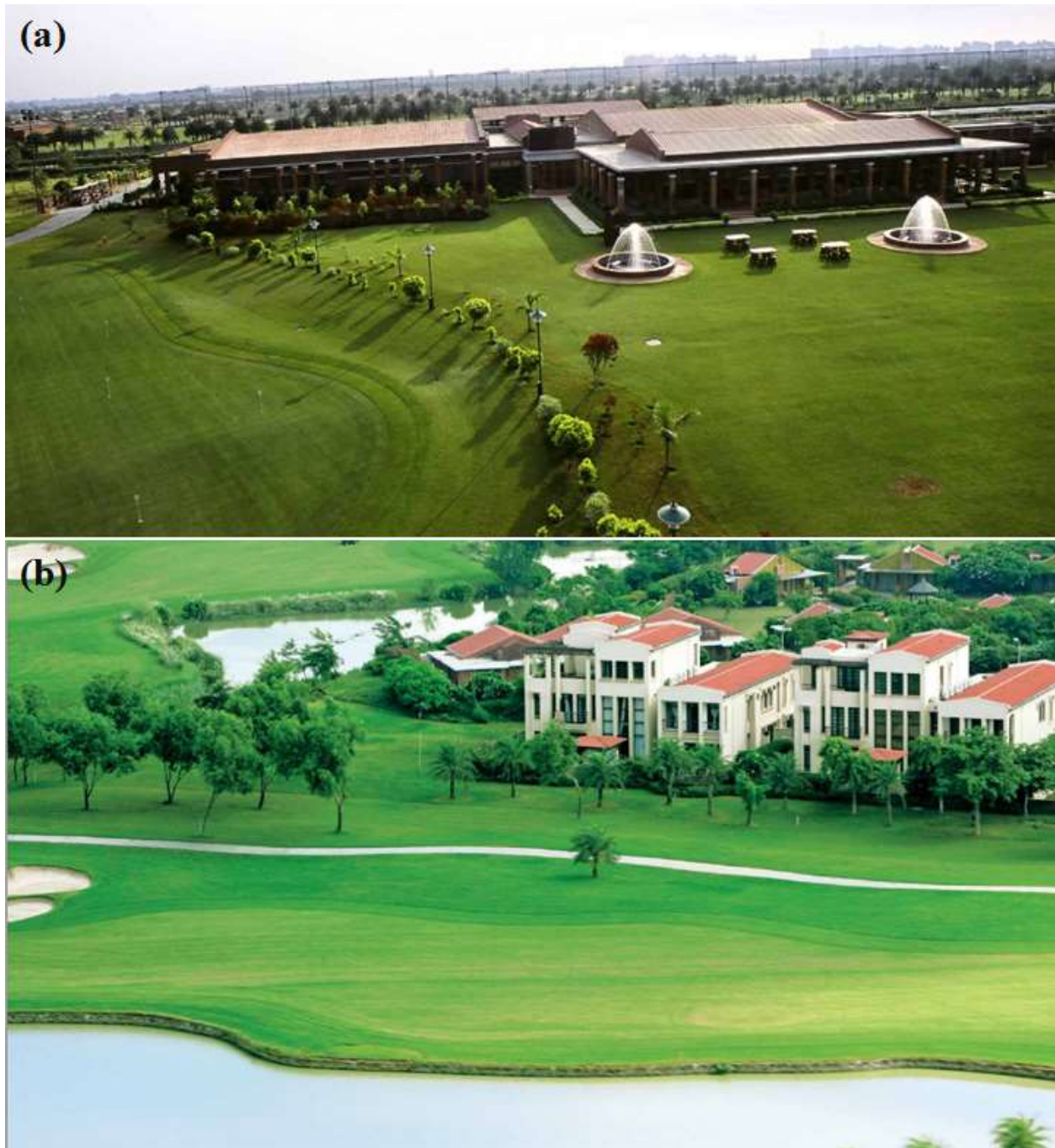
Figure 2: The landscaping and scenic beauty of the resort.