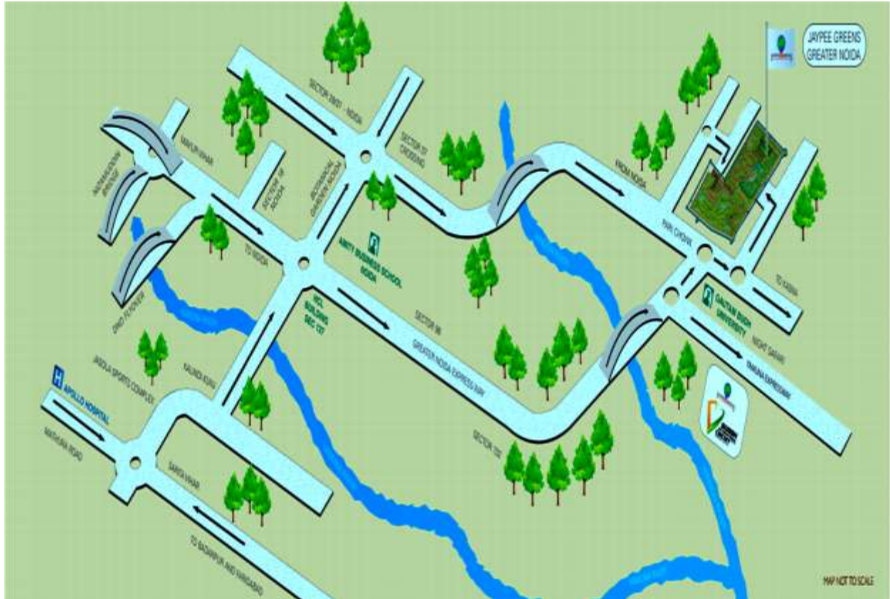
Figure 1: The Location of Jaypee Greens [10].