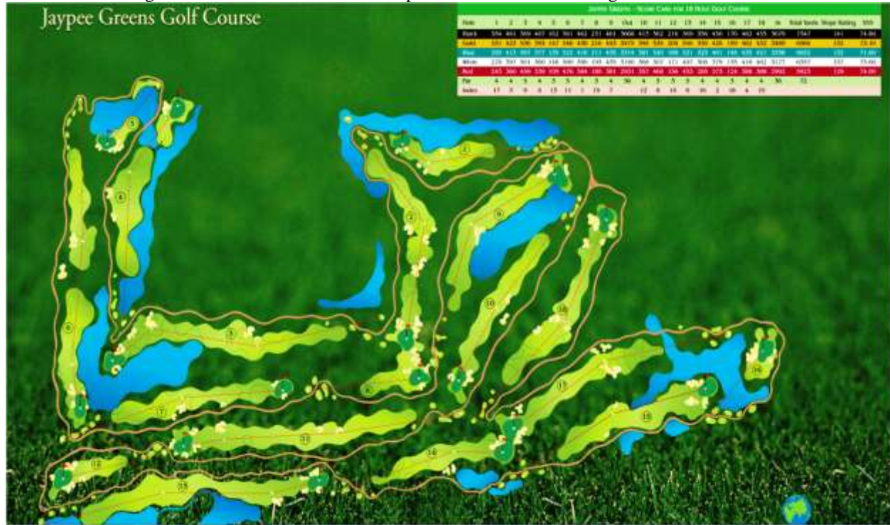
Figure 4: The Golf course map. Picture courtesy: Jaypee Hotels and Resorts [10].

The place has been carpeted with Bermuda Evergreen on the fairways and Tifdwarf on the greens, with which this Golf course's playing surfaces are a treat for the Golf connoisseurs. The visually striking bunkers, reminiscent of the Classic Melbourne Sandbelt course will surely hold your attention. The overall beauty of the place is more highlighted by the course landscaping which is there in the open and closed woodlands understory shrublands, wetlands and wild grassed areas. The Golf course map has been shown in the Figure 4.