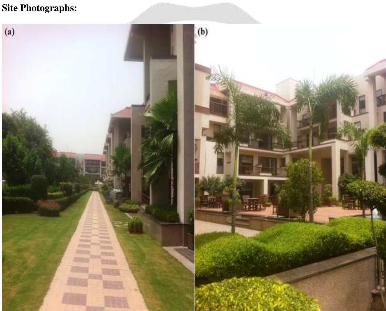
Figure 5: (a) Resort view (b) Outside sitting area