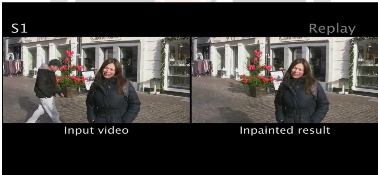
Fig -1: Video inpainting