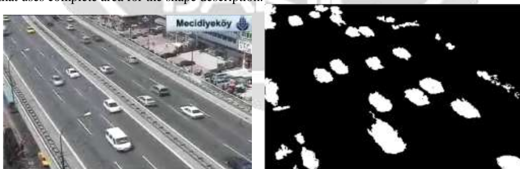
Figure 2. Moving Object Detection and Segmentation

The Experimentation data consists of a different videos collected from various sources. The video is preprocessed by de-noising technique using the wiener filter then the segmentation has been applied on the video frames of individual moving object detection and labeling is done. Noise reduction is done as the pre process in video in order to improve its quality. The results show the moving object through the rectangular box shape. under the region based method that uses complete area for the shape description.