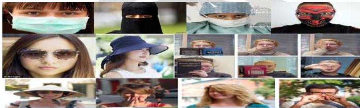
Figure 3:- Occlusion [1]

Tracking becomes difficult for target object due to its change in the appearance when target object gets occluded by other objects such as bridge, wall, etc. shown in figure 2