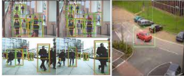
Figure 2:- object tracking [1]

Tracking becomes difficult for target object due to its change in the appearance when target object gets occluded by other objects such as bridge, wall, etc. shown in figure 2