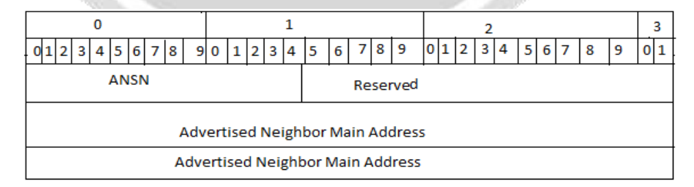
Fig. 2 TC Format [5]