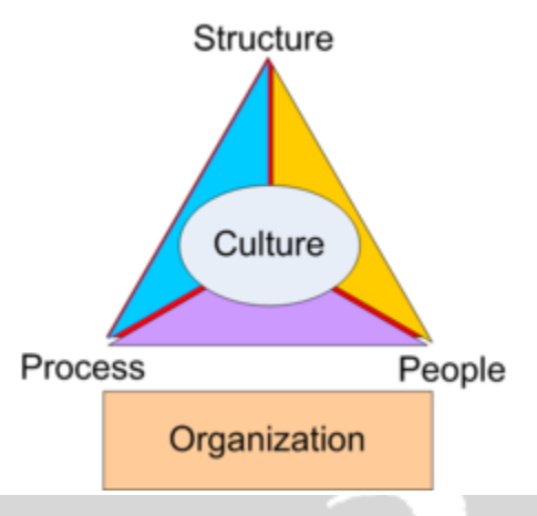
Figure 3.2 Organizational Culture

Although many studies have found that different companies in different countries tend to emphasize on different objectives, the literature suggests financial profitability and growth to be the most common measures of organizational performance. Wilderom and Berg (1998) argued that instead of striving for strong culture,