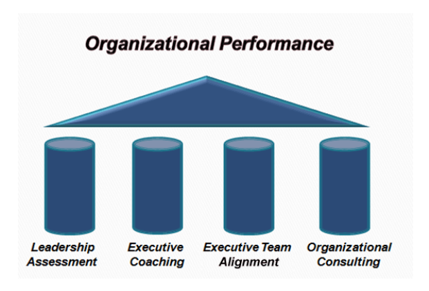
Figure 3.3 Organizational Performance

Organizational Performance one of the important questions in business has been why some organizations succeeded while others failed. Organization performance has been the most important issue for every organization be it profit or non-profit one. It has been very important for managers to know which factors influence an organization's performance in order for them to take appropriate steps to initiate them. However, defining, conceptualizing, and measuring performance have not been an easy task. Researchers among themselves have different opinions and definitions of performance, which remains to be a contentious issue among organizational researchers (Barney, 1997). The central issue concerns with the appropriateness of various approaches to the concept utilization and measurement of organizational performance (Venkatraman & Ramanuiam, 1986).