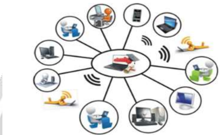
Figure 1. E-learning

to as computer based training, internet-based learning, web-based training, and online learning. Today, e-learning is extensively used on different educational levels such as academic courses, continuous education, company trainings, etc. A subset of e-learning is M-learning, M-learning is mobile learning, which means learning using portable devices that allow the learner to learn in different environments and whilst on the move instead of being restricted to a classroom setting or tied to a desk. The term has grown enormously in popularity in the past few years, with the advent of handheld wireless devices such as i-Pads and tablets and increasingly sophisticated mobile phones. The essential requirements for C-learning (classroom learning) are the building, teaching faculties, time duration for learning, hardware and software resources. Now a day's sometimes the teaching institute does not have enough classrooms, faculties/tutors, hardware and software. To make teaching and learning process time and cost effective the concept of e-learning is very useful. Thus, E-learning can be more effective than C-learning.