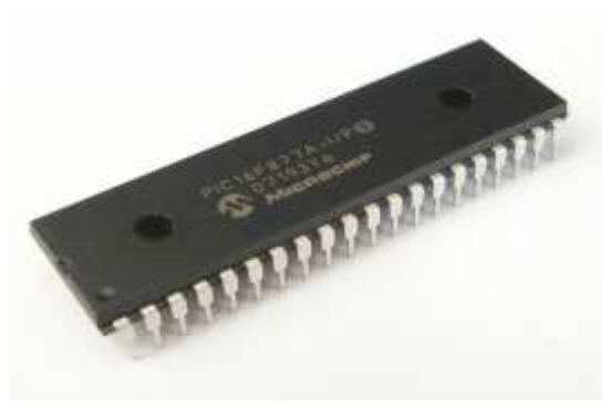
Figure 2: Microcontroller