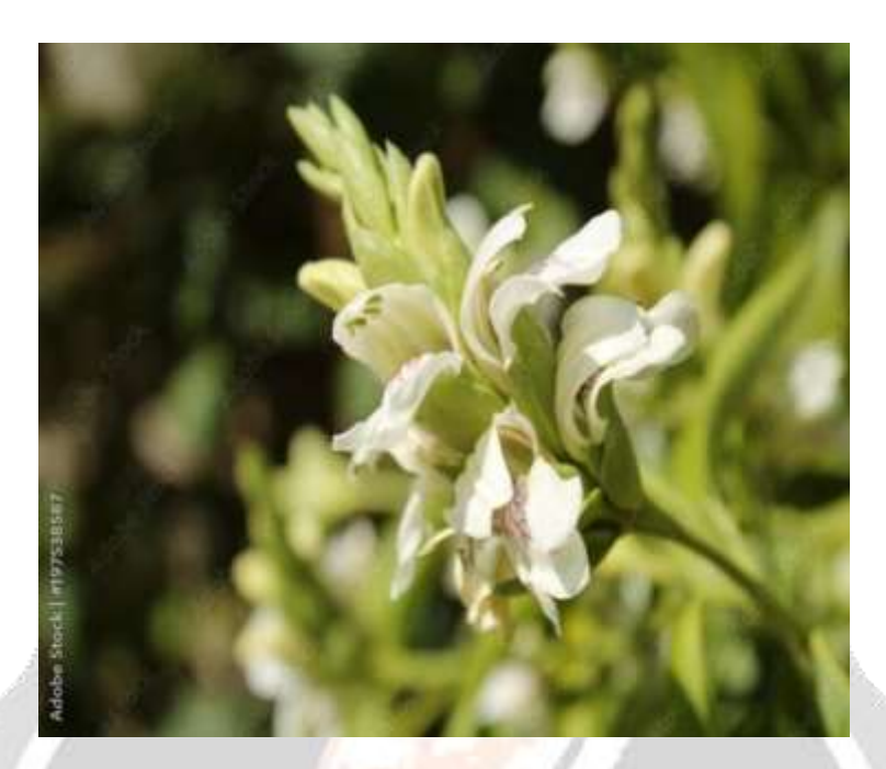
Fig.2 Adhatoda vasica