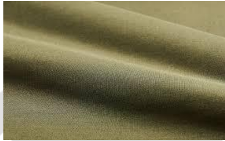
Fig.: 2 Ref.3

fire protection. [Ref.3 : DuPont. (2021)]