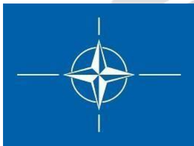
Fig.: 5 Ref.7