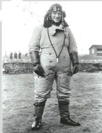
Fig.: 1 Ref.20

In the early days of aviation, pilots wore heavy leather jackets, wool clothing, and scarves to protect against extreme temperatures. These garments provided minimal protection against fire hazards and impact forces but were effective in insulation.