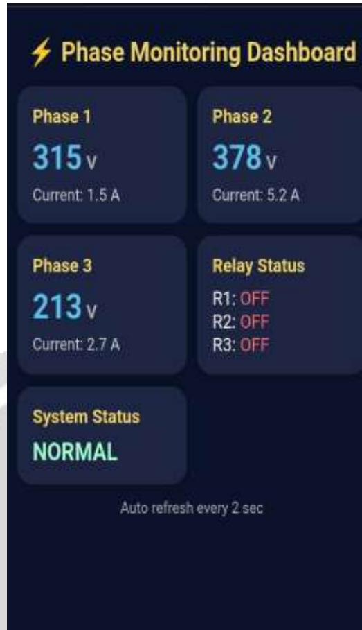
When all phases are Normally ON: System status is normal and all relays are in off state