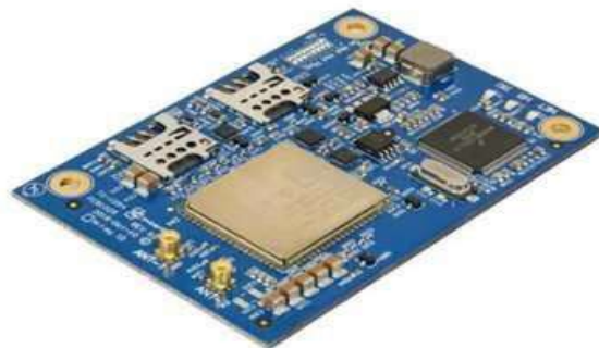
4) Communication Module