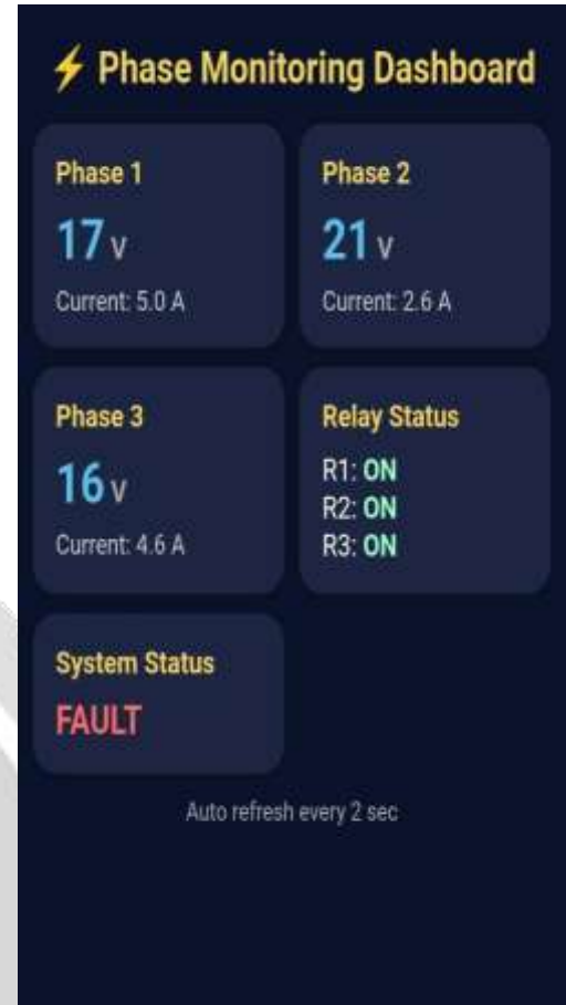
When total supply OFF: When system is OFF of complete supply interruption