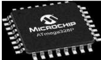
1) ATM 328 microcontroller