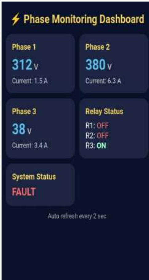
When Any Phase is Fault: its shown system status as fault and voltage and relay state