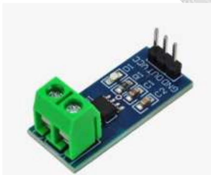
3) Current sensor