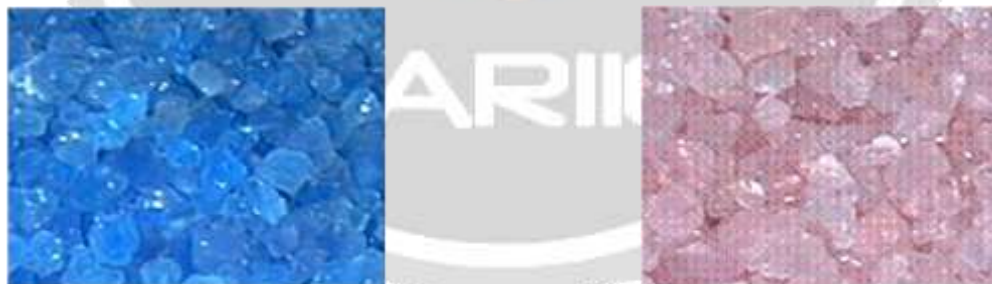
a) Ready to use silica gel

After absorbing moisture from the purified biogas, the color of the silica gel changed from blue to pink.