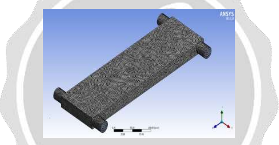
Fig. 3: Mesh diagram of mini channel heat exchanger

The computational domains are meshed with unstructured Tet/Hybrid grids. They are meshed by the CFX software, a geometric modelling and grid generation tool used with ANSYS CFX. Mesh diagram of minichannel heat exchanger are shown in Fig. 3