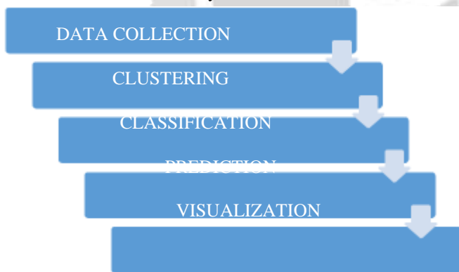
Fig1: Proposed Architecture

We propose a system which can analyze, classify and predict various crimes, find probability of crime occurrences in a given region. Our system is effective in terms of analysis, speed of crime, classify crime according to their type and show probability of crime occurrences in nearby location.