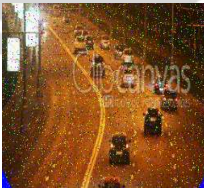
Fig -3 Test video frame.

Here the obtained spatial quality score 0.6256 lies between 0 and 1 for which the tested video is treated as a high quality video sequence.