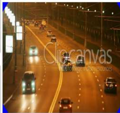
Fig -2 Reference video frame.

The Fig.2 shows the reference video frame where the optical flow is smooth and distortions are not affected. And Fig.3 shows the test video frame affected by salt and pepper noise so that optical flow is inconsistent and hence features are affected.