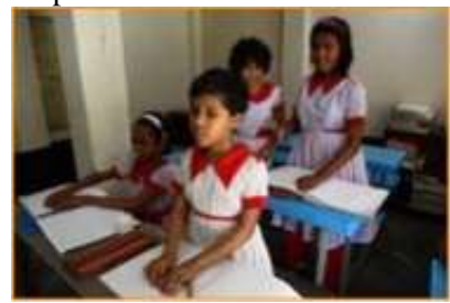
Figure 4: Students of Special Education School are learning in class room

[Source: Education for disabilities and rehabilitation, 1997] In other word, a residential educational set up where visually impaired students admitted exclusively in order to cater their special needs accordingly to special curriculum by special teacher.