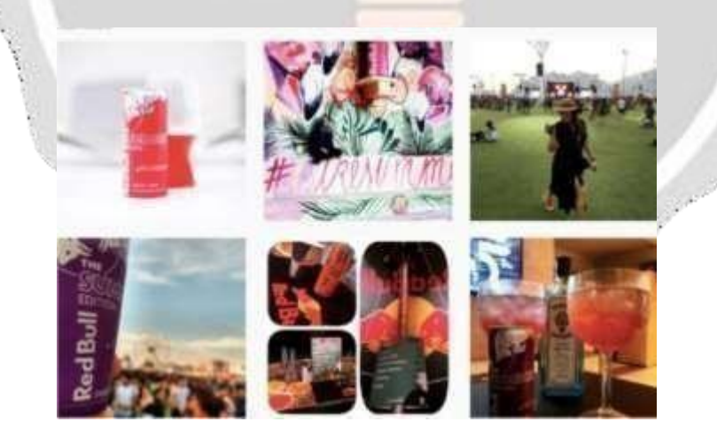
Figure 1.3: Instagram is the most used social media platform and is great for marketing

One of the ways to deal with use online media to create clients is to make exceptional electronic media content, for instance, sites and video, and offer it on your electronic media stages, for instance, Facebook, Twitter, LinkedIn and Instagram. Luckily, there are a combination of web-based media stages you can peruse, including Facebook, Twitter, LinkedIn, Instagram, Snapchat, and various others. Dependent upon your claim to fame and target swarm, you can pick whichever one(s) is by and large appropriate to your business.