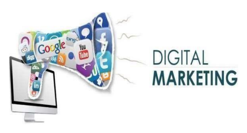
Figure 1.1: Digital Marketing