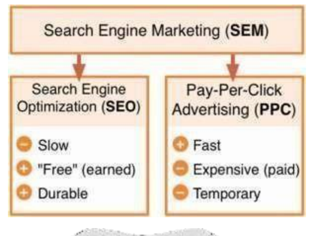
Figure 1.4: Weighing the odds between SEO and PPC