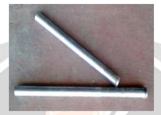
Fig 4.2 Shaft

The mechanical power produced by prime mover we used to drive various machines in the workshop & factories. A transmission system is the mechanism which deals with transmission of power & motion from prime move to shaft or from one shaft to the other.