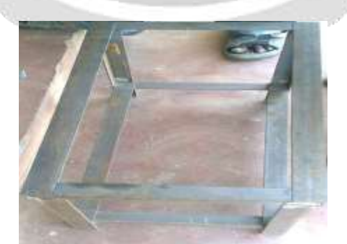
Fig 4.1 Frame