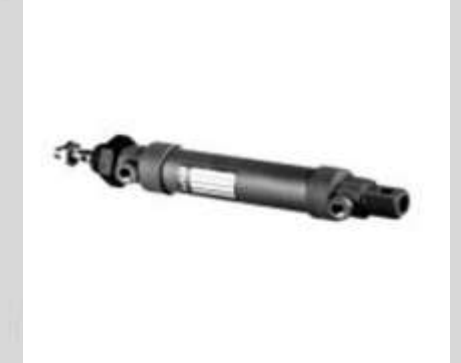
Fig 4.4 Pneumatic Cylinder

Because the operating fluid is a gas, leakage from a pneumatic cylinder will not drip out and contaminate the surroundings, making pneumatics more desirable where cleanliness is a requirement. For example, in the mechanical puppets of the DisneyTiki Room, pneumatics is used to prevent fluid from dripping onto people below the puppet.