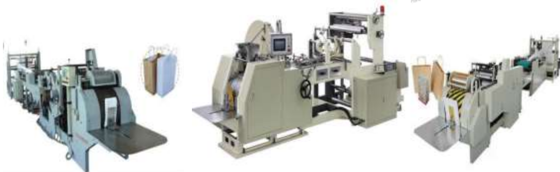
(a)Mahindra Engg. Company