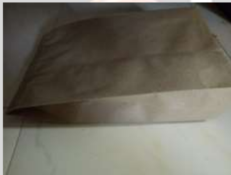
Fig.6.1:- Paper Bag