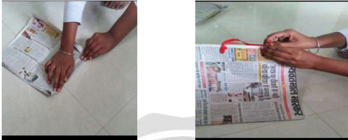
Fig. 3.1:- Paper Bag Making by Hand