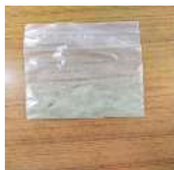
Fig:3.1.1 Aloe barbadensis miller gel pieces. Fig:3.1.2 Aloe barbadensis miller powder.