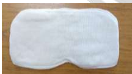
Fig.6.1 End product