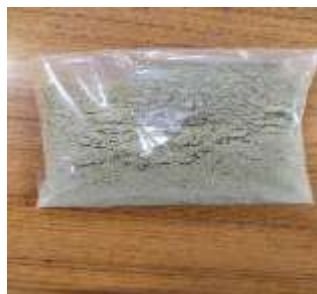
Fig.3.2.3 Madagascar Periwinkle powder