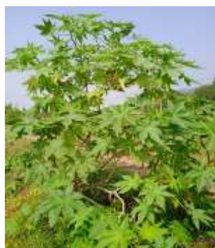
Fig.3.3.1: Ricinus Communis (Castor Oil)

Ricinus Communis (Castor Oil) non-volatile adipose oil attained from the seeds of the castor bean, Ricinus communis , of the spurge family (Euphorbiaceae). It's used in the product of synthetic resins, plastics, fibres, varnishes, and colourful chemicals including drying canvases and plasticizers. Ricinus Communis (Castor oil) is thick, has a clear and colourless to amber or greenish appearance, a faint characteristic odour, and a mellow but slightly acrid taste, with a generally sickening shadow. Ricinus Communis (Castor oil) is attained from castor sap either by pressing or by solvent birth. Both sap and oil painting are produced basically by India and Brazil and consumed primarily in the United States, largely in assiduity. In addition to the uses mentioned preliminarily, castor oil painting and its derivations are used in cosmetics, hair canvases, fungistatic( fungus-growth- inhibiting) composites, embalming fluid, publishing inks, cleaner, lubricants, greases and hydraulic fluids, dyeing aids, and cloth finishing accoutrements .