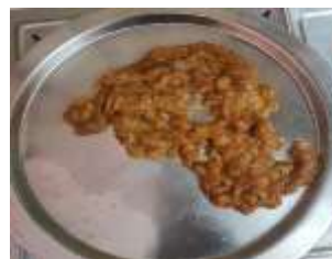
Fig.3.5.1.1 Treatment for Ceiba Pentandra Fig.3.5.1.2 Treatment for Ceiba Pentandra