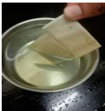
Fig.3.4.1.1 Madagascar Periwinkle