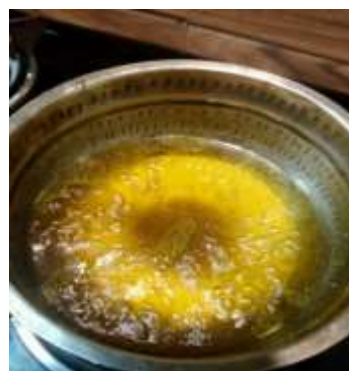
Fig.3.4.1.2 Madagascar Periwinkle