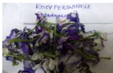
Fig.3.2.1 Fresh Madagascar Periwinkle flowers