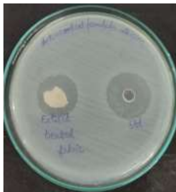
Fig.4.2 Anti-microbial Test.

Report: The result finds Vinca rosea +Aloe vera+ castor oil treated cloth having Zone of inhibition against the Candida albicans . The results show herbal treated fabric shows Anti-microbial activity.