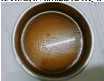
Fig.3.4.1.3 Madagascar Periwinkle (Nithya Kalyani)