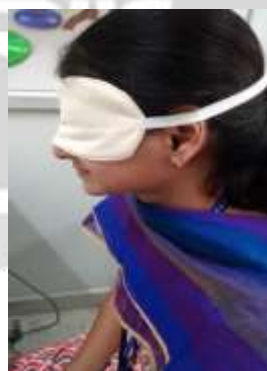
Fig.6.2 End product