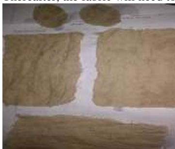
Fig.3.5.1.1 Ceiba Pentandra (kapok fabric)