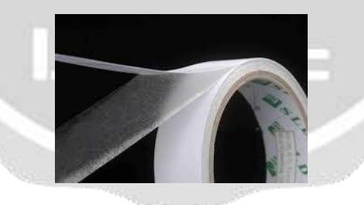
Fig 3.5: Double side tissue tape

Tissue tape is a special tape that comprises of non-woven tissue and is covered with solid glue on the two sides. It bonds solidly to comparable or disparate materials. High-Shear cement on the two sides. Solid cement, Bonds well to any surface Widely utilized by printers, crafters, and a lot more utilities. Advantageous to utilize simple to tear. Unique defined cement gives solid holding power and no cement weakening. Phenomenal temperature and dissolvable opposition. Great shear strength, the cement strength is not really impacted with temperature change and long stockpiling. No slippage even later an extensive stretch of use. This tape is of 1" width. (Fig 3.5) The thickness of tissue tape is 24 mm. It is fixed on the posterior of bio-plastic waterproof layer. It is fixed upward in three lines separating 6 mm between. This obsession shows in much the same way as sterile napkin work. This solid cement fixes on both bio- plastic external layer and underwear single shirt texture well.