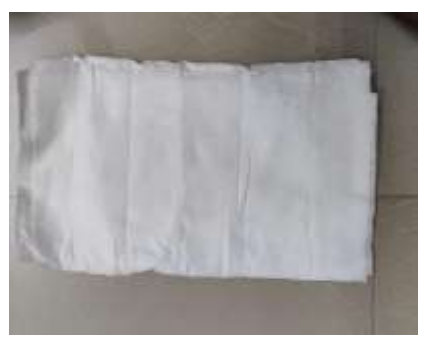
Fig 3.2.1: Top sheet