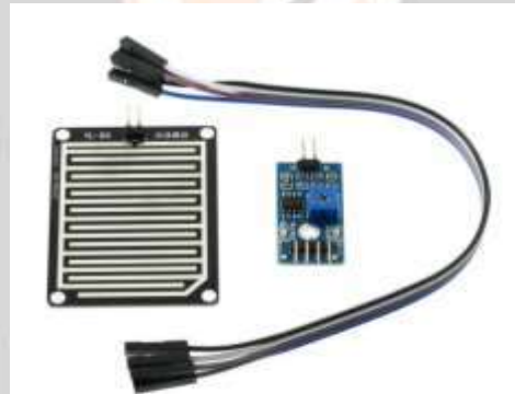
Fig-2: Rain sensor

A. Rain Sensor Module: It enables us to measure through the analog output pins and it provides the outcome in the digital form when the threshold moisture exceed. The element is based on the LM393 op amp. It consist of electronics of component and a printed circuitry board which collects the drops of rain. Since the raindrops are gathered on the circuitry board it makes the way for parallel resistance which is measured through the op amp. If the resistance is less then the voltage output is also less. As a result of which lowering the water will give higher output voltage on the analog pin. A completely dry board will led to the output of module up to five volts.