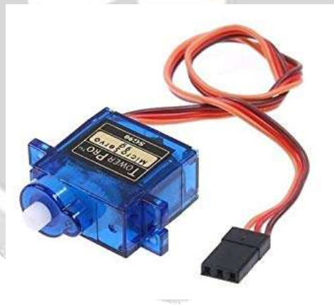
Fig-5: Servo Motor

D. Servo Motors: They are in existence for a long time and are used for various applications. They are very small in size but they are highly efficient. They are also being used for many industrial applications ,pharmaceutics, inline manufacturing, robotics and food services .Servos are handled by sending pulse of variable width also known as pulse width modulation using control wire. There is a maximum ,minimum pulse on a repetitive mode. The servo motor can turn in 90° and total of 180° movement. The position where the servo has the same amount of potential rotation in the clockwise and counter anticlockwise direction is called as motor's neutral position.