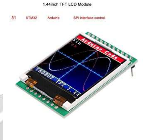
Fig-4: LCD Module

C. LCD Module: The LCD module used here is JHD162A. It is a 16*2 LCD module which is based on HD44780 driver manufactured by Hitachi. It consists of 16 pins which can be operated in a two mode either in a 4 bit mode and 8 bit mode. Here we are using 8 bit mode.