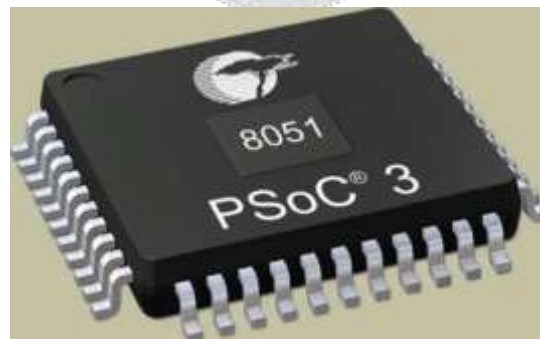
Fig-3: Micro- Controller

B. Micro Controller: The LCD module used here is JHD162A. It is a 16*2 LCD module which is based on HD44780 driver manufactured by Hitachi. It consist of 16 pins which can be operated in a two mode either in a 4 bit mode and 8 bit mode. Here we are using 8 bit mode.