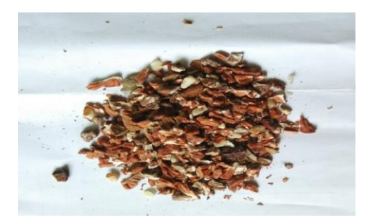
Fig-1 cutting output betel nut