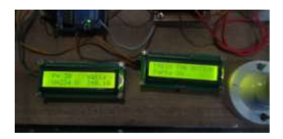
Fig 3 Hardware Setup