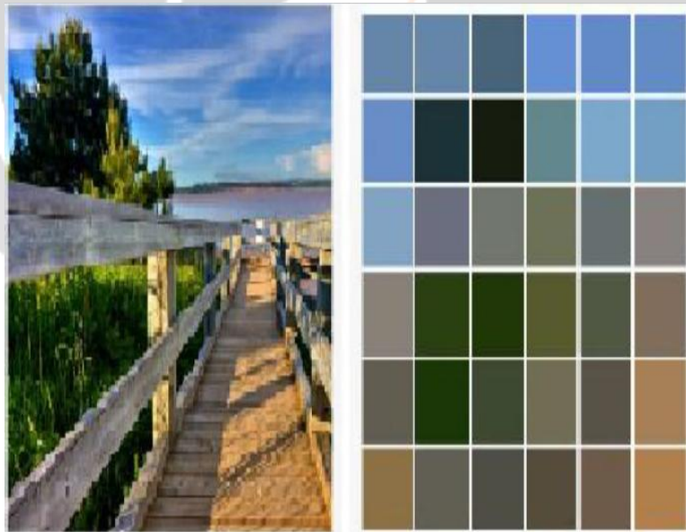
Fig-1: Average RGB.

A very simple way of extracting a colour palette from an image, one technique would be to average the colour values within specific areas. Averaging colour values is almost identical to averaging numbers, except with the added initial step of finding the red, green and blue components of the colour [4] [2].