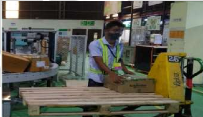
FIG 5 SCISSOR LIFT HPT