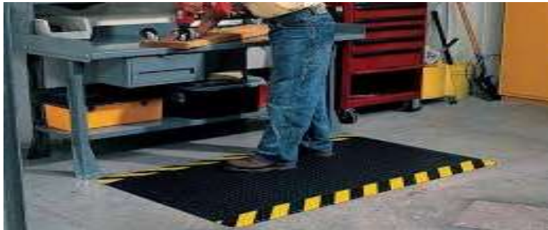
FIG 6 ANTI-FATIGUE MATS