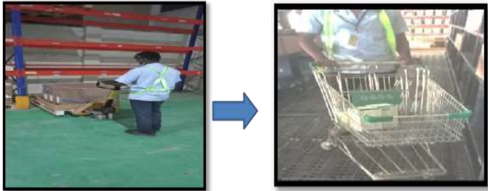
FIG 4 REPLACE HPT FOR CART TROLLEY.