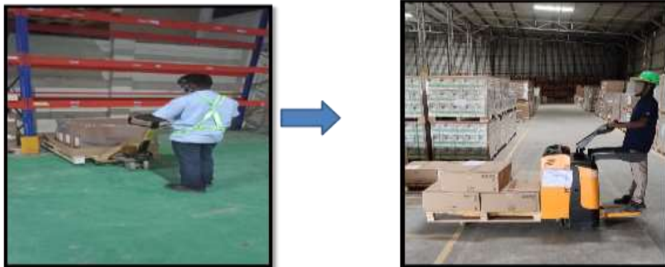
FIG 3 IMPLEMENTATION OF BOPT FOR HPT