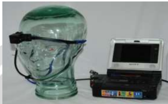
Fig.1. First-generation video-based eye trackers: Mobile Eye

E.1 Videooculography Videooculography (Fig.1.) tracks the development of the eye utilizing cameras that can be either remote or mounted on the head. The information got from these cameras is then dissected by a PC. For good nature of eye following the camera is focused in on the eye. This diminishes the working point of the camera and subsequently requests that the client sits still. It likewise requires an unhindered perspective on the eye. Thus, the exactness of following gets effectively influenced by lighting conditions, glasses, substantial cosmetics, or squinting of the eye. It gives a precision of 4degrees, which isn't palatable. Its principle advantage is that it is agreeable and non-meddlesome.