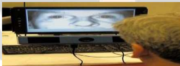
Fig 2. IR used to illuminate the eye and its reflection on cornea provides an additional reference point that improves accuracy

IR-PCR (Fig.2.) utilizes the corneal impression of IR waves as a source of perspective point alongside the student to ascertain the purpose of look. This kind of following gives a genuinely decent precision of 0.5 degree and furthermore permits impressive head developments. Its hindrance is that it can't be utilized under changing light conditions, for example, surrounding light.