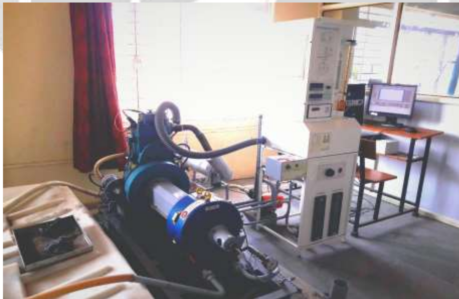
Fig -1: Compression Ignition Engine Set Up Used For Experimental Purpose

The photograph of diesel engine with pressure thermocouple for sensing exhaust gas temperature as shown in FIG. It is of single cylinder, four stroke, water cooled, and compression ignition engine with a bore of 80mm and stroke 110mm. Fuel is supplied to the fuel pump by gravity feed, through the fuel tank and paper element filter. The engine can be started by hand cranking using decomposition lever.