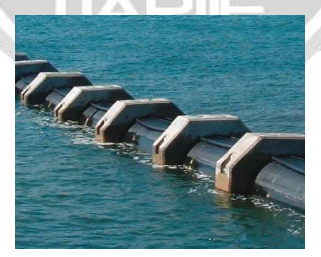
Fig -1: Marine Wastewater Outfalls and Treatment Systems

Hydropower refers to the process of converting energy from flowing water into electrical energy. This process depends on the kinetic and potential energy of water and is carried out as water rotates the installed hydro-turbine. This movement will convert the energy from the turbine into mechanical energy. The rotating turbine is coupled with the generator's shaft to convert the mechanical energy into useful electrical energy. Hydropower is considered to be the most reliable and flexible type of renewable energy source providing 19 % of the planet's electricity.