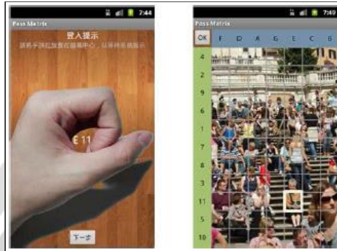
Fig. 4: (a) Obtain the login indicator (E, 11) directly. (b) Obtain the login indicator through a predefined image

through another predefined image. If using a predefined image, for instance, if the user chooses the square (5, 9) in the image as in Figure 3(b), then the login indicator will be (E, 11). For the acoustical delivery, the indicator can be received by an audio signal through the ear buds or Bluetooth. One principle is to keep the indicators secret from people other than the user, since the password (the sequence of pass-squares) can be reconstructed easily if the indicators are known.