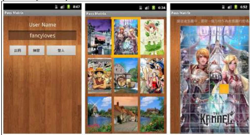
Fig. 2: (a) The Main page of PassMatrix, users can register an account, practice or start to log in for experiment. (b) Users can choose from a list of 24 images as their pass-images. (c) There are 7_ 11 squares in each image, from which users choose one as the pass-square.

usage of one-time login indicators. A login indicator is randomly generated for each pass-image and will be useless after the session terminates. The login indicator provides better security against shoulder surfing attacks, since users use a dynamic pointer to point out the position of their passwords rather than clicking on the password object directly.