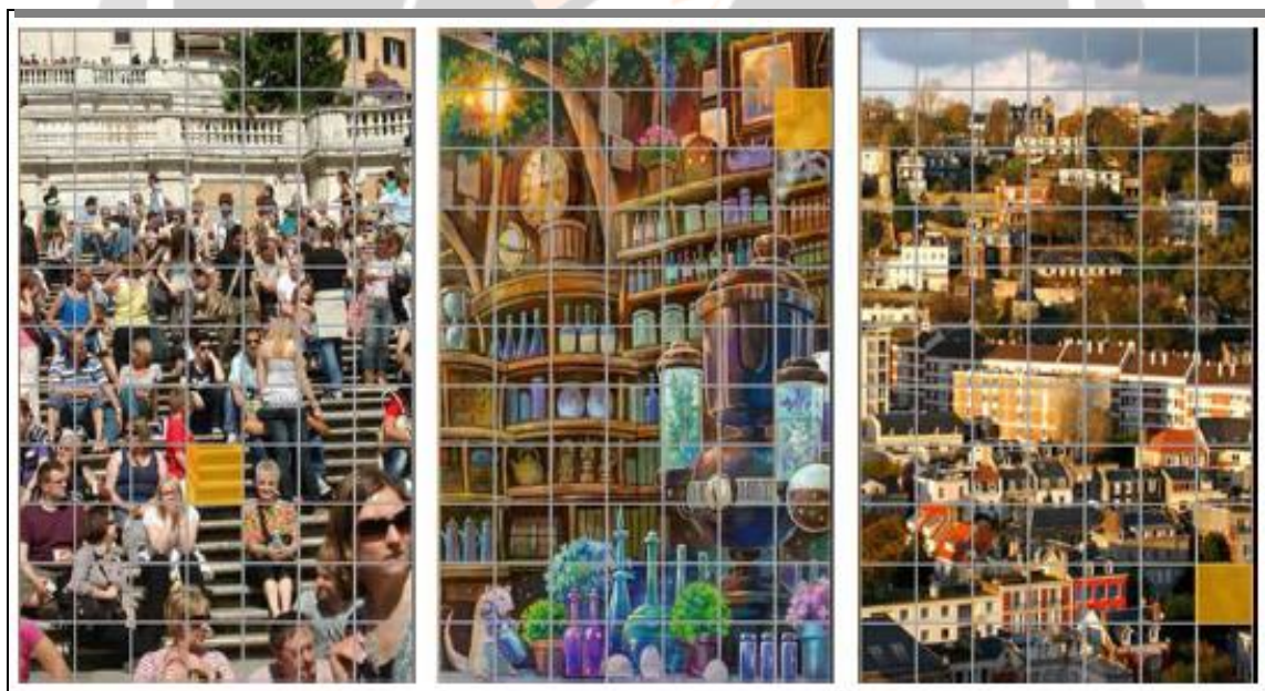
Fig.3: Shoulder Surfing Graphical Password