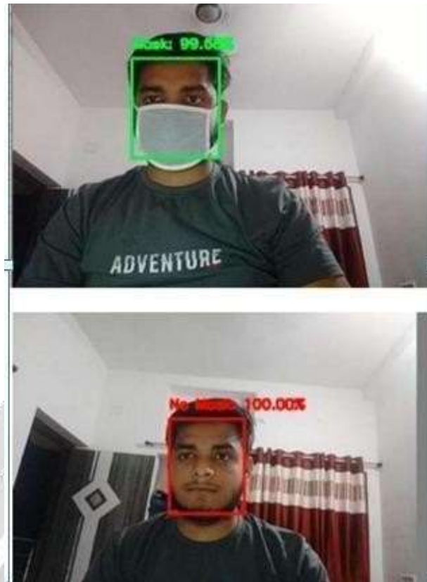
Detect face with mask or without mask in real time video stream