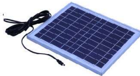
Figure 3.2 Solar panel

Solar panel is use to convert solar radiation to the electrical energy. When the PV cell absorbs light, the energy of absorbed photon is transferred to the electron-proton system of the material, creating charge carriers that are separated at the junction. The charge carriers in the junction region create a potential gradient, get accelerated under the electric field, and circulate as current through an external circuit. Solar array or panel is a group of a several modules electrically connected in series parallel combination to generate the required current and voltage. Solar panels are the medium to convert solar power into the electrical power.