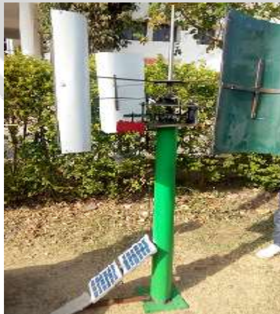
Figure 5.2 Actual overview of the project