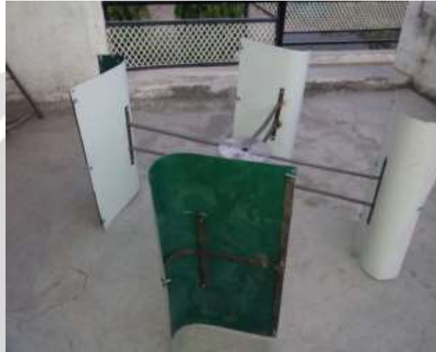
Figure 3.3 Actual wind turbine

Wind turbine is that system which extracts energy from wind by rotation of the blades of the wind turbine. Basically wind turbine has two types one is vertical and another is horizontal. As the wind speed increases power generation is also increases. The power generated from wind is not continuous its fluctuating. For obtain the non-fluctuating power we have to store in battery and then provide it to the load.