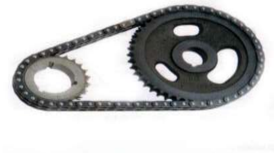
Figure 3.4: Chain and sprocket

Chains have a surprising number of parts. The roller turns freely on the bushing, which is attached on each end to the inner plate. A pin passes through the bushing, and is attached at each end to the outer plate. Chains omit the bushing, instead using the circular ridge formed around the pin hole of the inner plate.