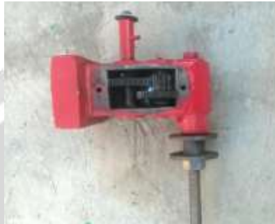
Figure 3.5 Gear box

Spur gears are most common type of gear. They have straight teeth, and are mounted on parallel shaft. Spur gear are regularly used for speed reduction or increase, torque multiplication. They are most useful component of transmission because variation in counter shaft and main shaft torque is depend upon gear ratio.