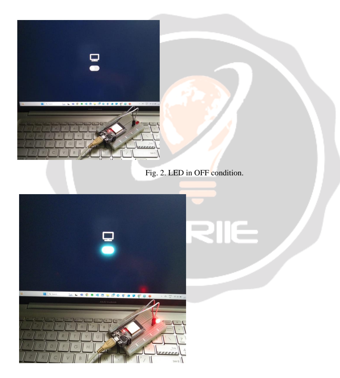
Fig. 3.LED in ON condition

Overall, result analysis in the proposed home automation system involves a systematic evaluation of the system's performance using various metrics and techniques, with the goal of continually improving the interface and the reliability.