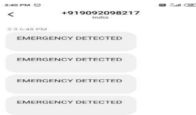
Figure.4. Image of Message Notification