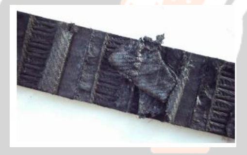
Influence of oil & solvents on belts

The timing belts are especially sensitive to high temperatures, action of chemical compounds and foreign bodies. Materials used for making of the belts are rubber, urethane (polyurethane), and neoprene and similar that is more or less not resistant to high temperatures. When rubber belts work at high temperatures for a long period, rubber compounds gradually harden, losing their features. The cracks appear at the back surface of the belt leads to belt failure.