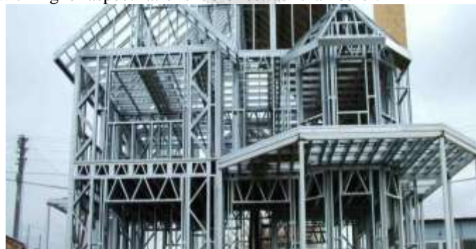
Fig. 4 Sample Structure of cold form steel structure

In this research we are analyzing beam column moment connections with bolted joints. Square and rectangular tubular sections are used in this study. Total 20 Models are created in the ANSYS workbench Finite element analysis software with square columns and is connected with rectangular beam with different type of connections. The results are compared by moment rotation and load v/s deflection which indicates most suitable connection for similar loading. The results are compared by moment rotation and load v/s deflection which indicates that the beam with higher aspect ratio is more restrain than other.