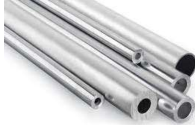
Fig.3 tabular section

In recent construction industry cold formed steel hollow sections simply called tubular sections are practiced in all major structural steel design standards .