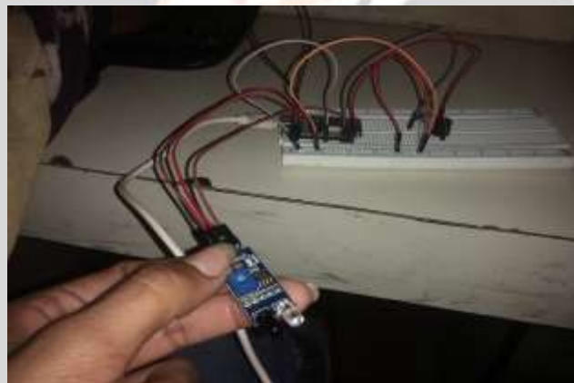
Fig -3: Hardware Connection with IR Sensor

An infrared sensor is an electronic device, that emits in order to sense some aspects of the surroundings. An IR sensor can measure the heat of an object as well as detects the motion. These types of sensors measure only infrared