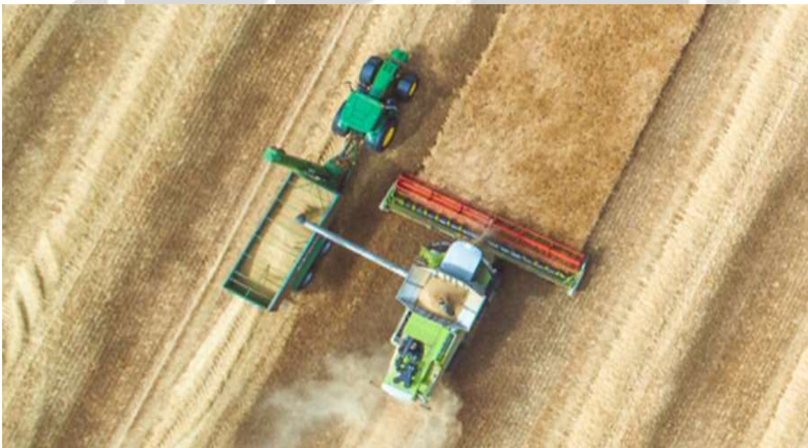
Fig -1: GIS software and GPS agriculture [4]