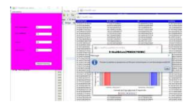
Fig 3.2 The classifier showing the hypoglycemia result

In figure 3.2, the classifier predicts the outcome as the patient having hypoglycemia which is true as observed by the abnormal rise in the temperature of the patient, decrease in heart rate, increase in blood pressure and decrease in the blood sugar level.