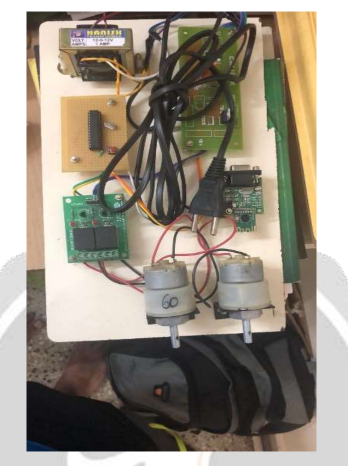
Figure 2.3: Relief Triggering System

The Figure 2.3 shows the relief triggering system which is in action when there is an abnormal condition detected by the wearable device. The system has two motors, one of them which gets turned on in case of high temperature situation and the other which gets turned on in case of low blood pressure. If any one of the situation arises, the motor gets turned on in order to show that the relief is being implemented as well as a notification is sent to the doctor or the patient's peers.