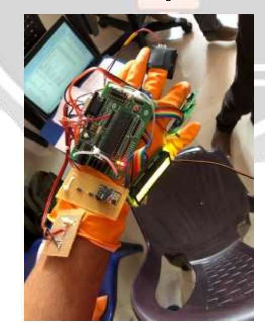
Figure 2.2: The wearable device

The Figure 2.2 shows the wearable device in the form of a glove.