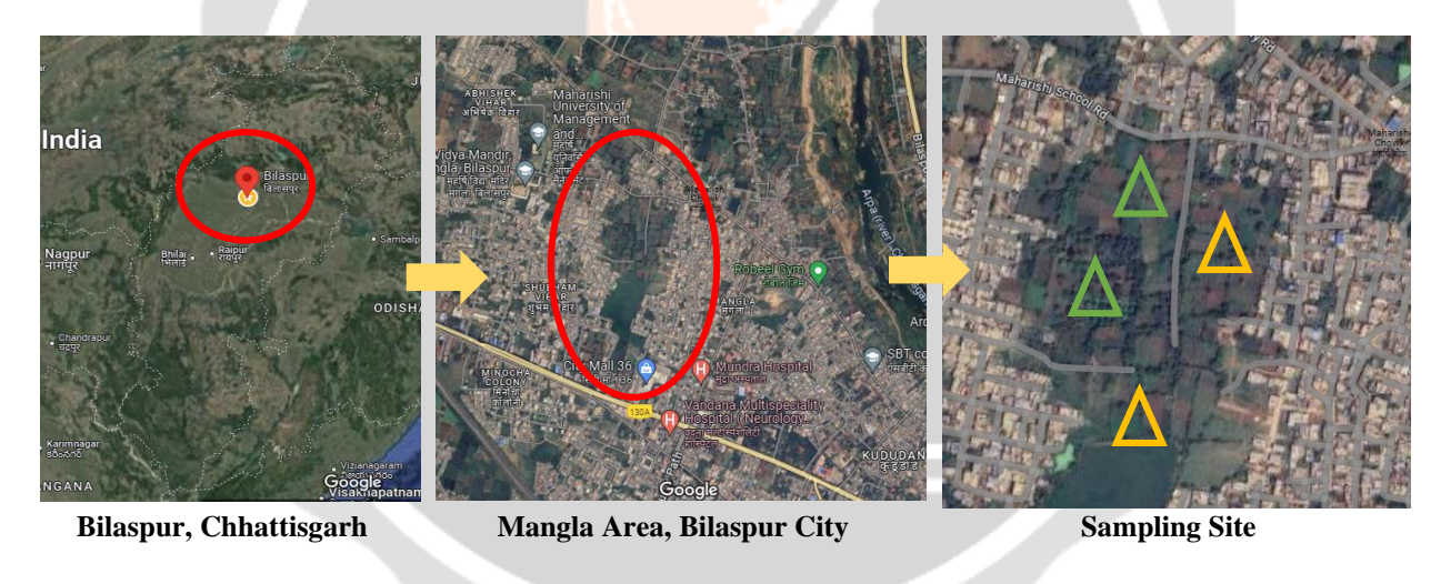
Fig. 1. Details of Sampling Sites of Mangla Area, Bilaspur Chhattisgarh, India

The research was done to isolate the PGPR from the rhizospheric soil and assess their correlation with the soil's physiochemical properties in the interest of sustainable agriculture. The soil samples were collected from the Agriculture field of the Mangla area (Geographical coordinate: 22.101206482827983, 82.12481191569194) located near Bilaspur City.