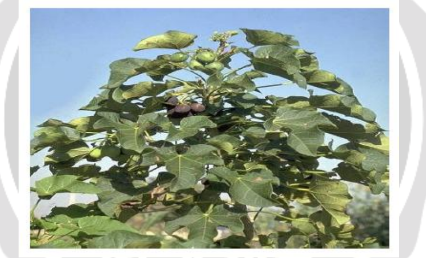
Fig-1: Jatropha curcas plant

Jatropha oil is lauded as being sustainable, and that its production would not compete with food production, as it can also survive and sustain in unfertile land, it can grow even on gravelly and sandy soils. It can thrive on the poorest stony soil. Jatropha can be intercropped with many cash crops such as coffee, sugar, fruits and vegetables, which offers both fertilizer and protection against livestock. Oil content of Jatropha seeds varies from 28% to 40%. The oil contains 21% saturated fatty acids and 79% unsaturated fatty acids. There are some chemical elements in the seed, Cursin, which are poisonous and render the oil not appropriate for human consumption. These factors render Jatropha oil as most appropriate form for producing biodiesel substituting petroleum diesel. It has desirable physicochemical and performance characteristics comparable to diesel. Each jatropha seedling should be given a 2m x 2m area to grow. 20% of seedlings planted will not survive. Jatropha tree is 3.5kg of beans. The oil is extracted from seeds using an oil press (expeller type used) which can extract around 75% of oil from seeds. The residue can be used as biomass feedstock to power electricity plants or used as fertilizer (it contains nitrogen, phosphorus and potassium). India is keen on reducing its dependence on coal and petroleum to meet its increasing energy demand and encouraging Jatropha cultivation is a crucial component of its energy policy.