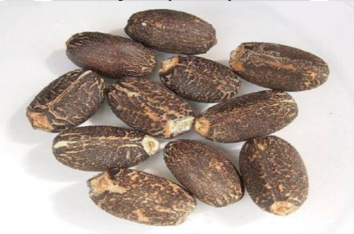
Fig-2: Jatropha curcas seed