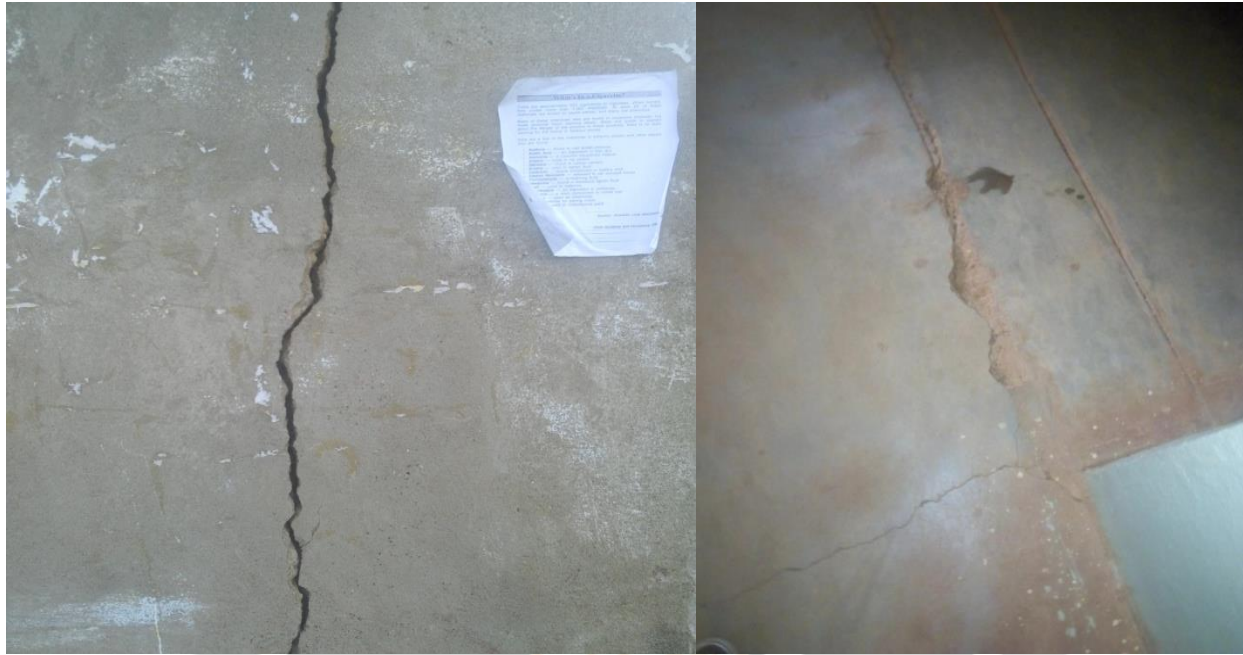
Figure 6. Picture of Active Vertical cracks wall and Horizontal crack floor

The crack has a continuous movement that moves in one direction at a uniform speed and is generated by the application of a length of amount of stress on the material, usually more than the designed stress holding capacity of the material. It has one millimetre wide.