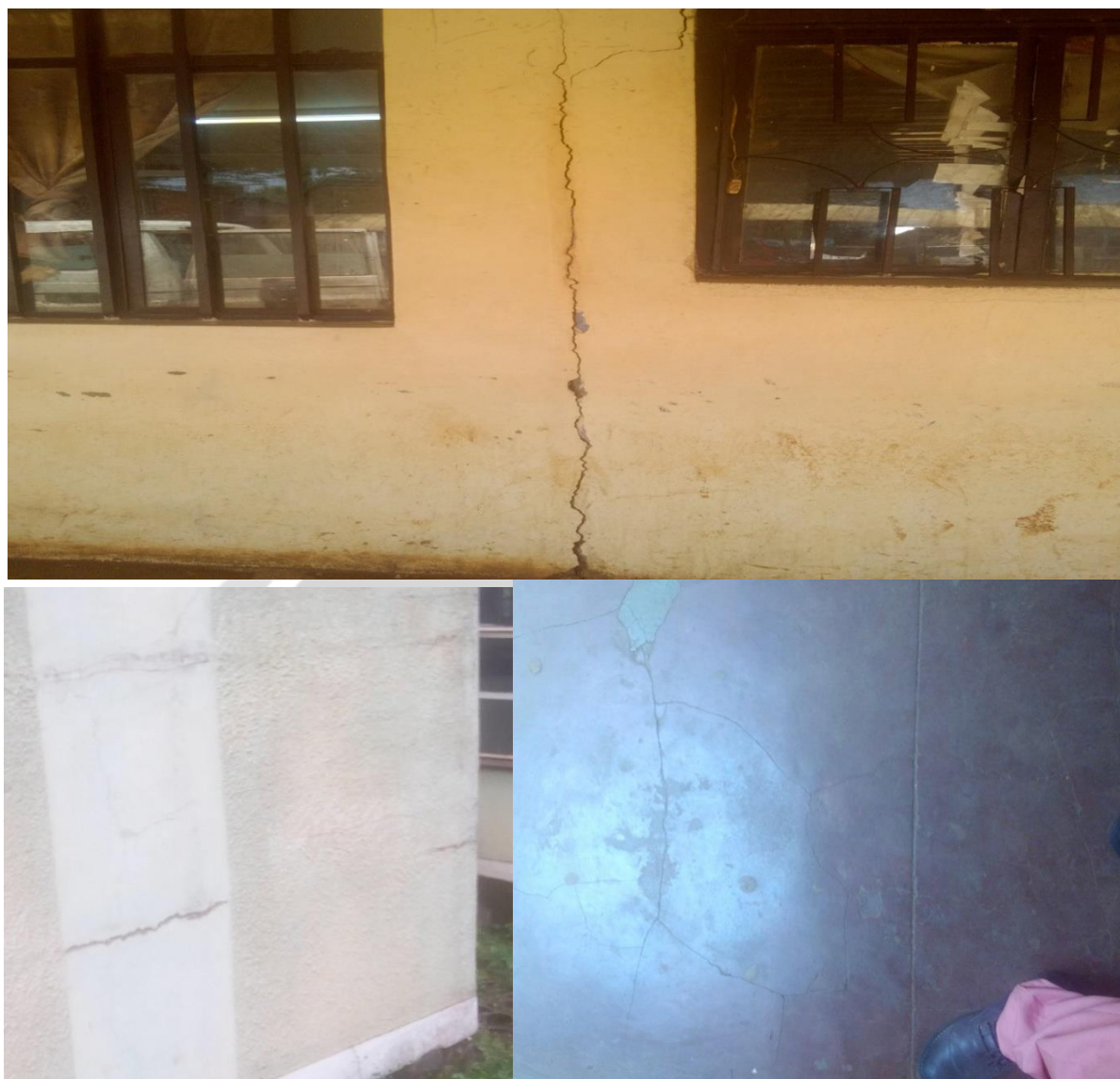
Figure 13. Picture of Active Vertical, Horizontal Crack for walls and Random Crack for floor