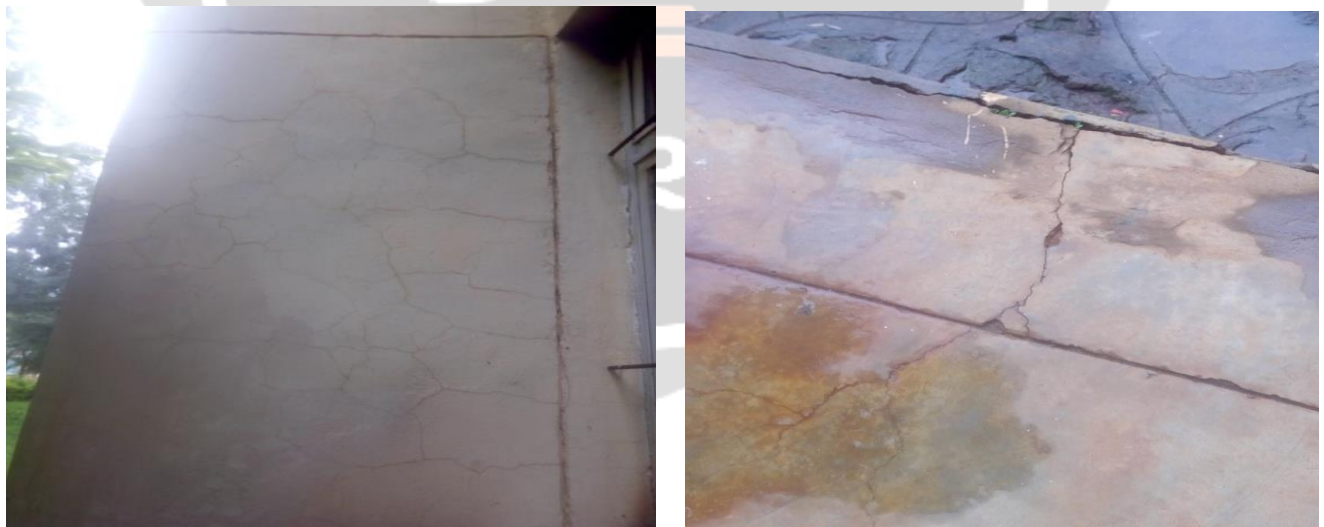
Figure 7. Picture of Random cracks wall and Horizontal crack floor

Another type of cracks (as displayed in plate 4) occurred at wall F0, A-R3-w3(as seen external view). due to the earth under the house is not strong enough to support the weight of the structure, so the structure starts to move