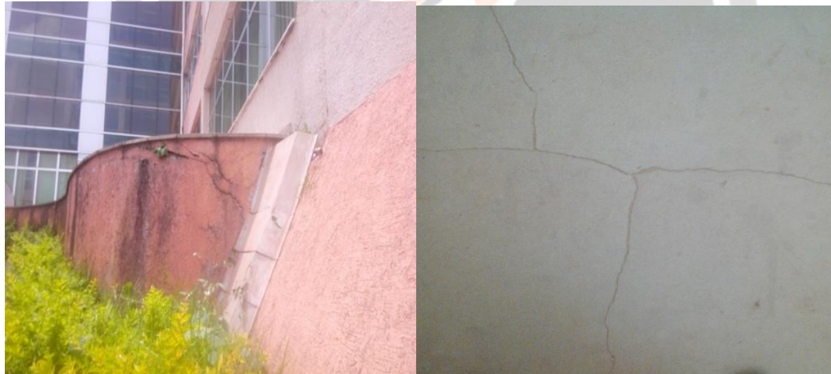
Figure 4. Picture of random cracks wall and floor

Moreover, random cracks were observed on floors in the internal building. The main cause to this cracks may be due to moisture movement of shrinkage soil (block cotton soil) when the foundation is shallow. The building blocks that was seen in such crack was F1-R2 and F1-R3.