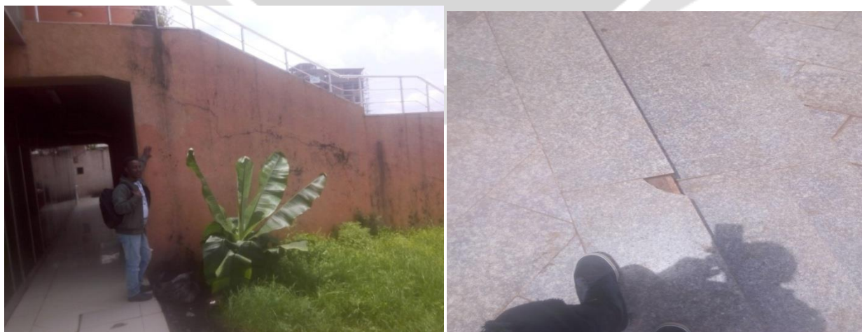
Figure 1. Picture of Diagonal cracks on wall and interior defect ceramic floor

The drying shrinkage cracks were occurred due to the properties and proportions of components, as well as mixing manner, in addition, it can be resulted because of the amount of moisture; while curing dry environment. (as seen externally) (As observed Externally) (see F4,1) The crack is wider at the top and become narrow as it travels downward. The cause of the crack may appear when it is built on shrinkage clay soil like block cotton soil and shallow foundation.