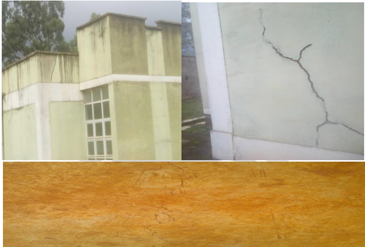
Figure 10. Picture of Active Diagonal Crack for walls and Random Crack for floor

During the observation, it was seen that the major cracks on the floors and walls of the building were surface cracks. Hence, it is a shrinkage crack. The shrinkage cracks observed could occur due to the excessive use of cement to sand, and also not gluing adequate covering services. In addition, drying shrinkage may occur due to the contracting of a hardened concrete mixture due to the loose of capillary water. This crack was seen F1-R2-w4, F2-R2-w5 and F2-R4-w2.