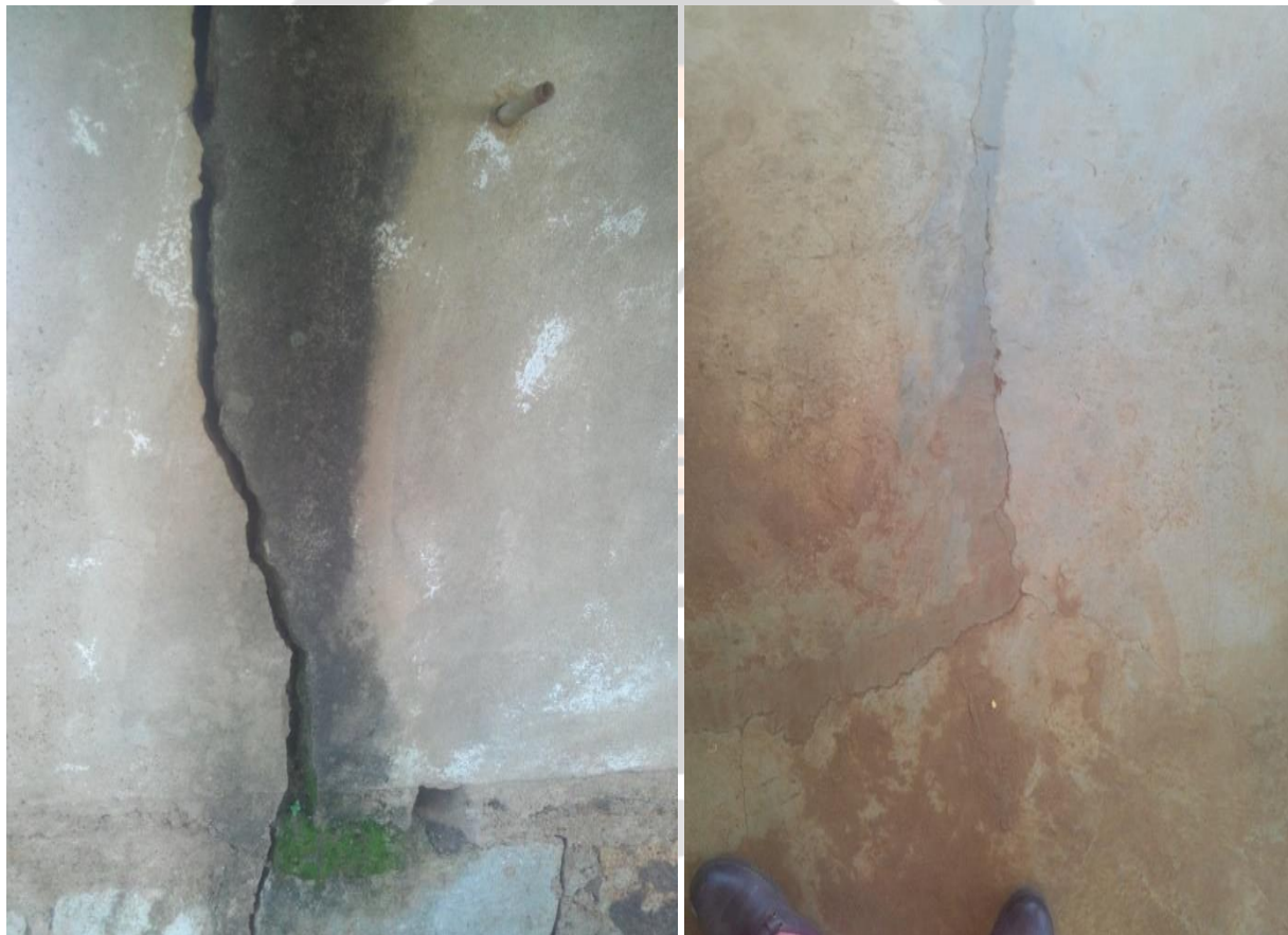
Figure 5. Picture of Active Vertical cracks wall and Horizontal crack floor

Wolaita sodo University Teaching and referral ottona Hospital has three blocks, and each block have two and three floors. The basement the floors were coded as FB; the ground floor (named F0), the second floor (named F2), the first floor (named F1). (As shown in platelet). The structural frame members of the building consist totally 20, 3 and 45 beams, 65 columns, respectively. The building has a roof with gutter for proper drainages and was covered with aluminium roofing sheets. The retaining wall of the roof links the basement floor to the ground floor. The most dominantly observed types of cracks in the building was active cracks, which is constantly changing in some way either in terms of its length, width or depth over time.