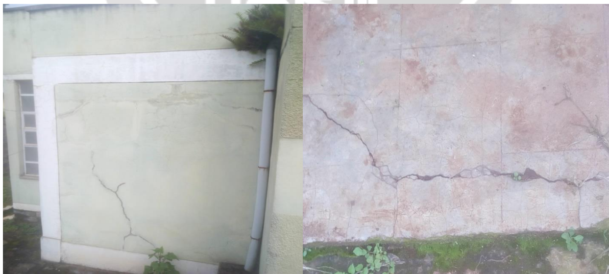
Figure 11. Picture of Active Diagonal Crack for walls and Horizontal Crack for floor

During the observation, it was seen that the major cracks on the floors and walls of the building were surface cracks. Hence, it is a shrinkage crack. The shrinkage cracks observed could occur due to the excessive use of cement to sand, and also not gluing adequate covering services. In addition, drying shrinkage may occur due to the contracting of a hardened concrete mixture due to the loose of capillary water. This crack was seen F1-R2-w4, F2-R2-w5 and F2-R4-w2.