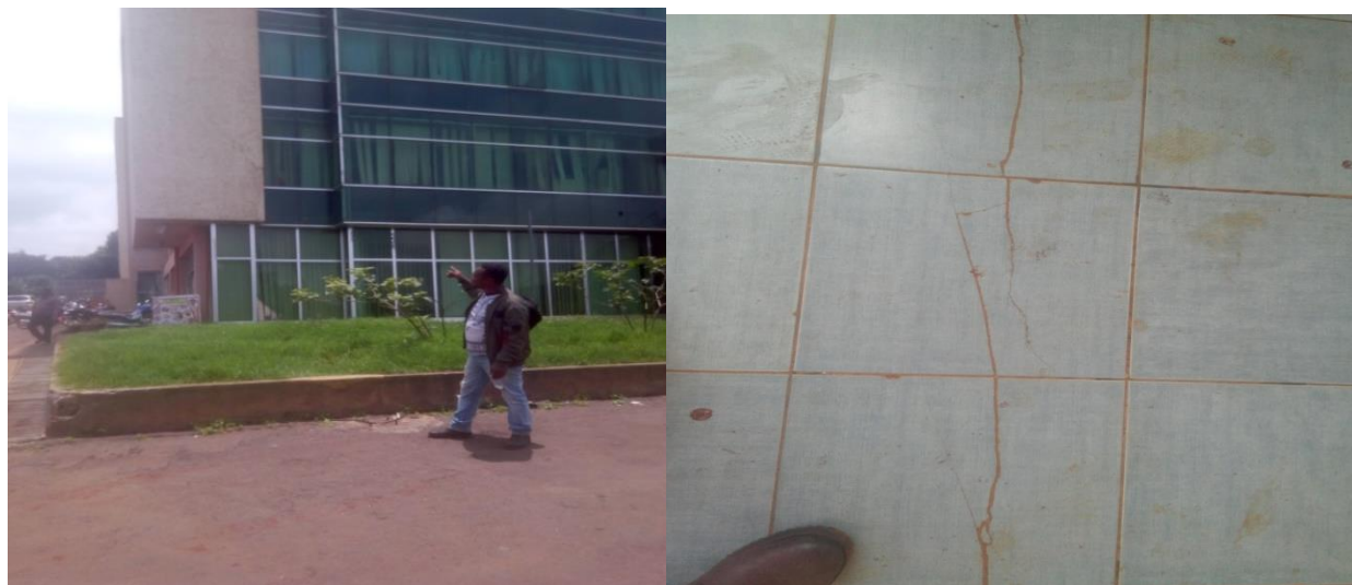
Figure 2. Picture of Diagonal cracks on wall and floor

Another types of cracks that was observed at wolaita Sodo Administrative office building was vertical cracks on the floor. The floor where this vertical crack appear was F1-R3 and F1-R2. The cracks may appear due to a combination of poorly foundation on footing, blasting or on adjacent building (as displayed in Fig,3.)