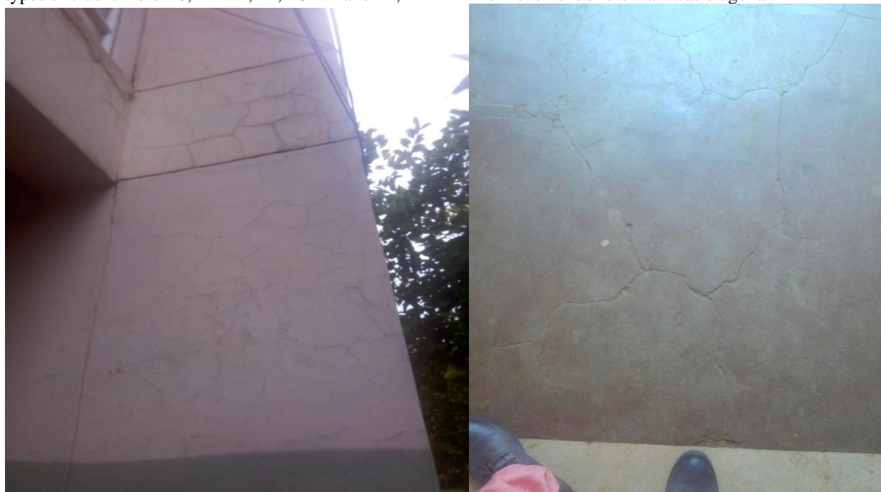
Figure 8. Picture of Random cracks wall and Random crack floor

tapering and were wider at the top, and occurred due to foundation settlement. The floors and walls affected by this types of cracks were-F0, R1-w4, F1, R3-w4 and F2, R2-w4. The movement of the wall was diagonal.