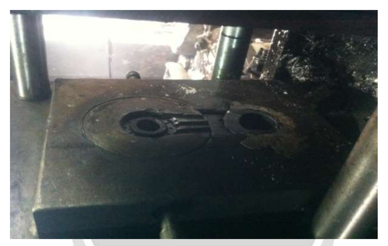
Figure1:Die casting tool

During the cold-chamber die casting process, the molten charge (more material than is required to fill the casting) is ladled from the crucible into a shot sleeve, where a hydraulically operated plunger pushes the metal into the die. The extra material is used to force additional metal into the die cavity to supplement the shrinkage that takes place during solidification. The principle components of a cold-chamber die casting machine are shown below. Injection pressures over 10,000 psi or 70,000 KPa can be obtained from this type of machine. Thus the component –motor rotor made of aluminium is obtained.