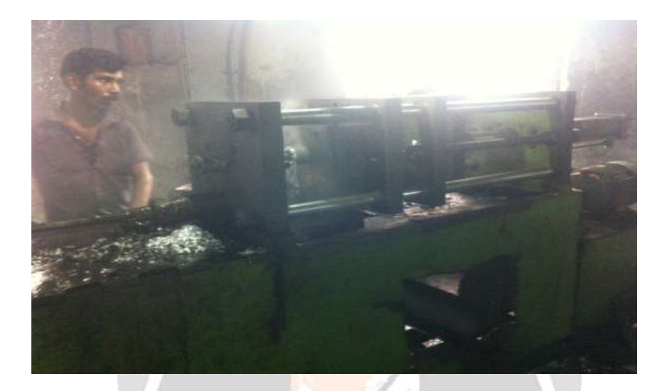
Figure2:Die casting tool working in machine