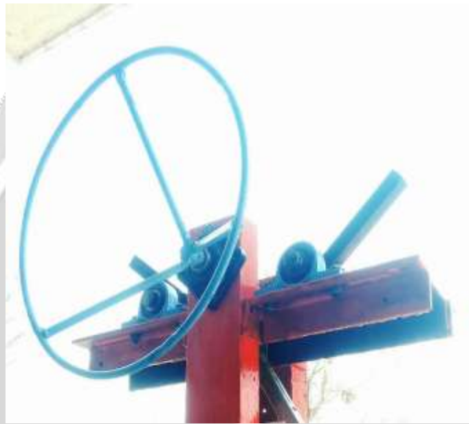
Fig. Assembly of Bending Machine