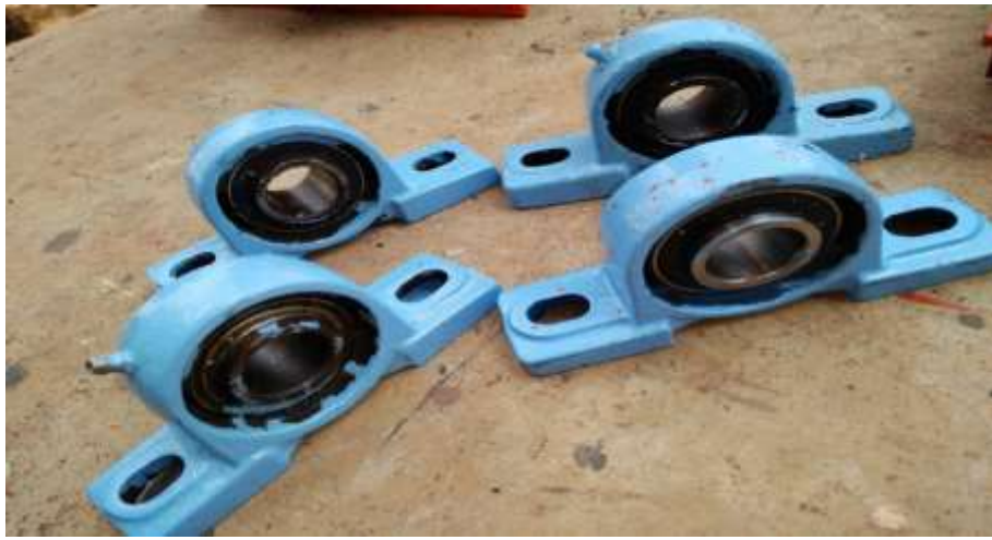
Fig. Pedestal Bearings