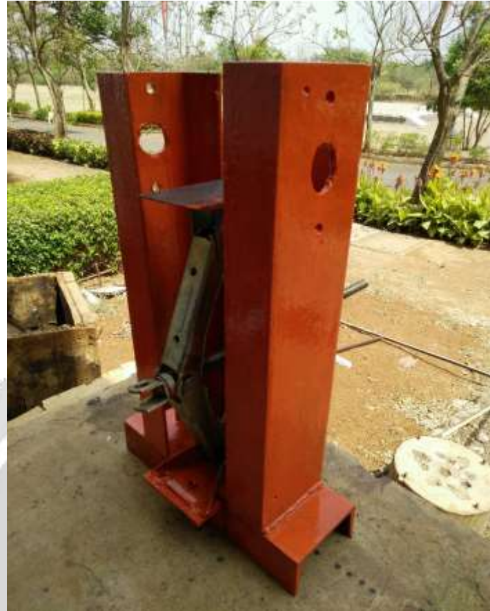
Fig. Assembly of C-Channels and Toggle jack