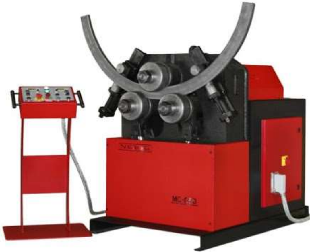
Fig Bending Machine